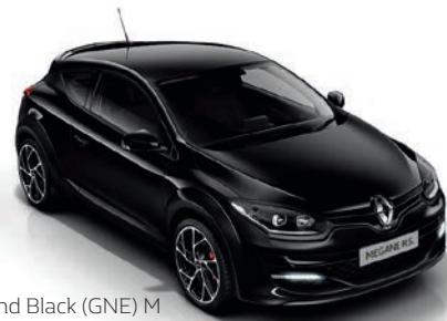
Diamond Black (GNE) M