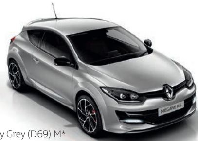
Mercury Grey (D69) M*