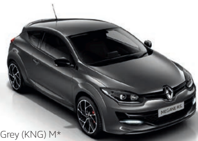
Oyster Grey (KNG) M*