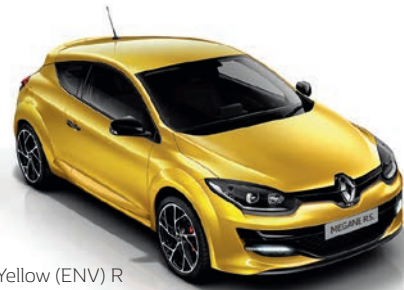
Liquid Yellow (ENV) R