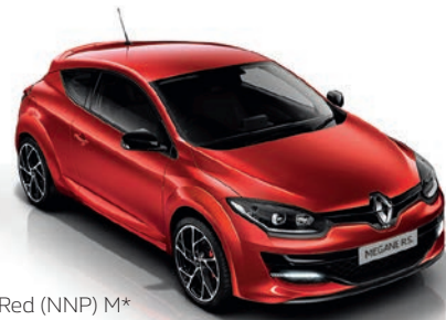
Flame Red (NNP) M*