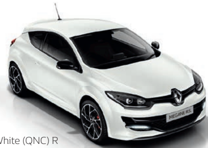
Pearl White (QNC) R