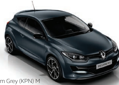
Titanium Grey (KPN) M