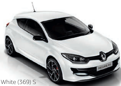
Glacier White (369) S