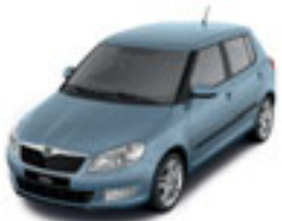
Satin Grey metallic