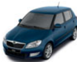
Pacific Blue uni