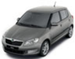
Cappuccino Beige metallic