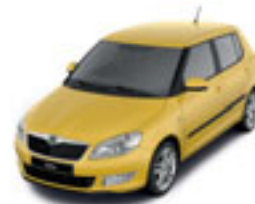
Sprint Yellow special