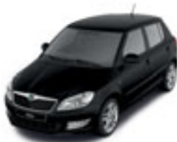
Black Magic pearl effect