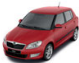
Corrida Red uni