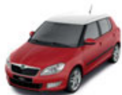
Corrida Red uni with white roof