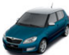
Lava Blue metallic with roof and external mirrors in silver