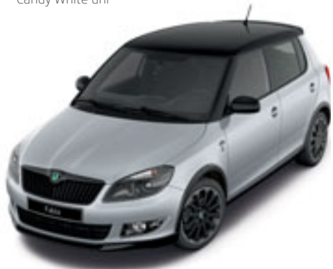
Brilliant Silver metallic