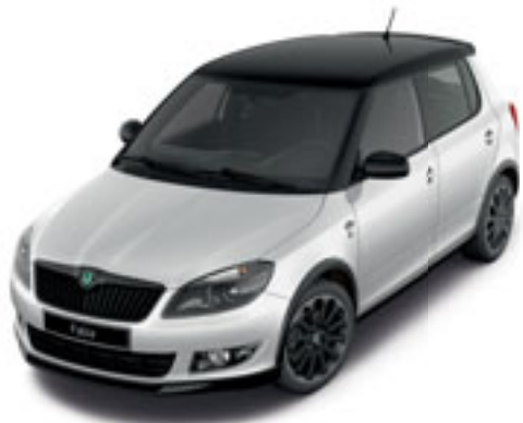
Candy White uni