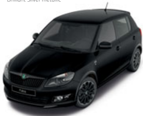
Black Magic pearl effect