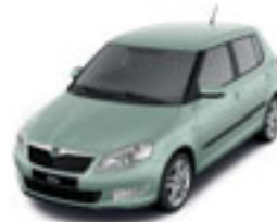
Arctic Green metallic