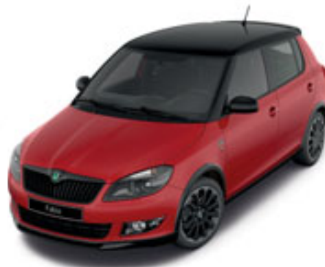
Corrida Red uni