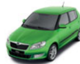
Rallye Green metallic