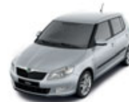
Brilliant Silver metallic