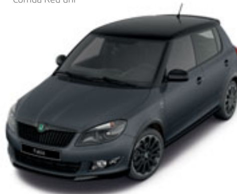
Anthracite Grey metallic