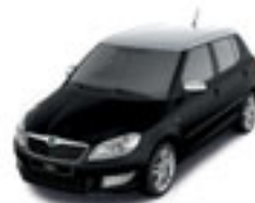
Black Magic pearl effect with roof and external mirrors in silver