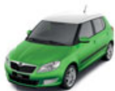
Rallye Green metallic with white roof