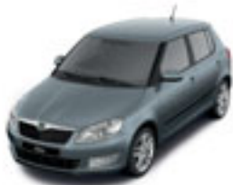
Platin Grey metallic