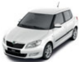
Candy White uni