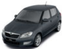
Anthracite Grey metallic