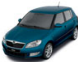
Lava Blue metallic