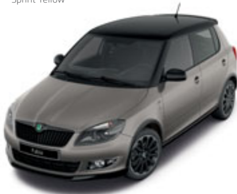
Cappuccino Beige metallic