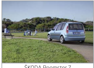
ŠKODA Roomster 7