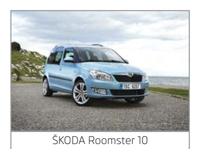
NEW ŠKODA ROOMSTER / JUNE 2012