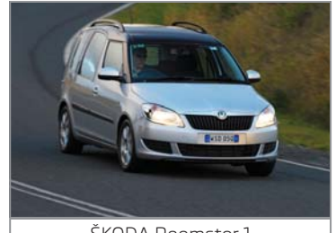
ŠKODA Roomster 1