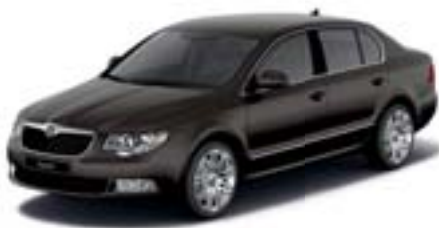
Magnetic Brown metallic