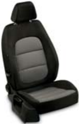
Rubicon interior - Ambition grey/black fabric