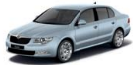
Aqua Blue metallic