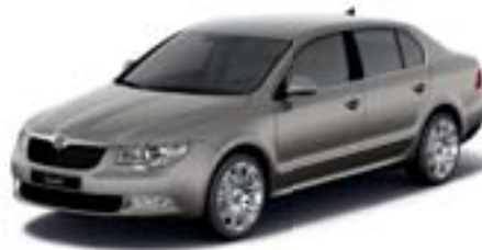
Cappuccino Beige metallic