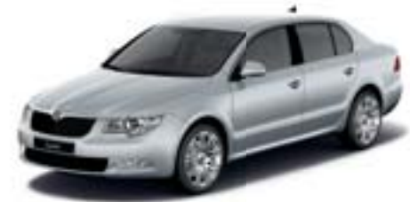
Brilliant Silver metallic