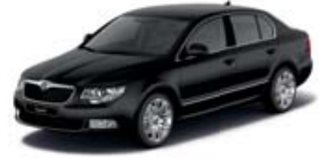
Black Magic pearl effect