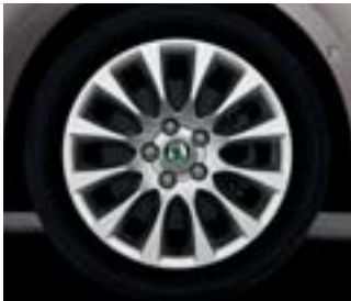
Laurel 7.5J x 17" alloy wheels for 225/45 R17 tyres.