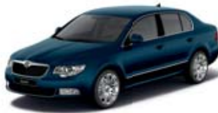
Pacific Blue uni