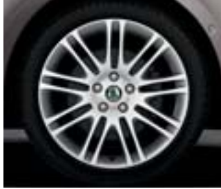
Luxon 7.5J x 18" polished alloy wheels for 225/40 R18 tyres.