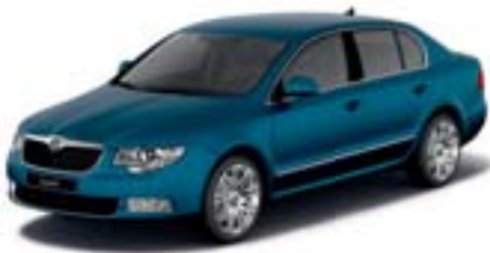
Lava Blue metallic