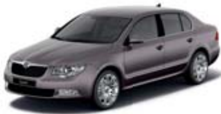
Amethyst Purple metallic