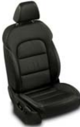
Glamour interior - Ambition, Elegance black leather/artificial leather