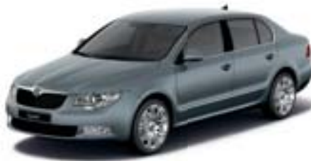
Platin Grey metallic