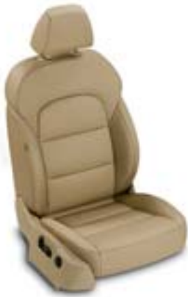
Glamour interior - Elegance ivory leather/artificial leather