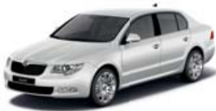
Candy White uni