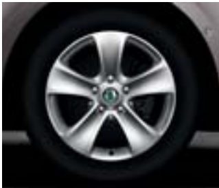
Moon 7.0J x 16" alloy wheels for 205/55 R16 tyres.