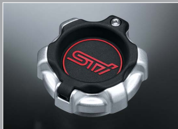
OIL FILLER CAP