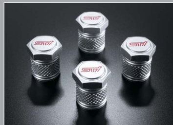
VALVE CAP SET