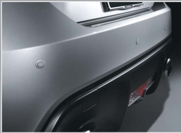
REAR PARK ASSIST KIT