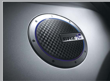
FUEL LID GARNISH