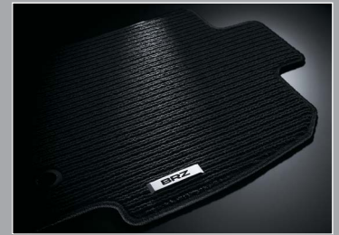
CARPET MAT SET