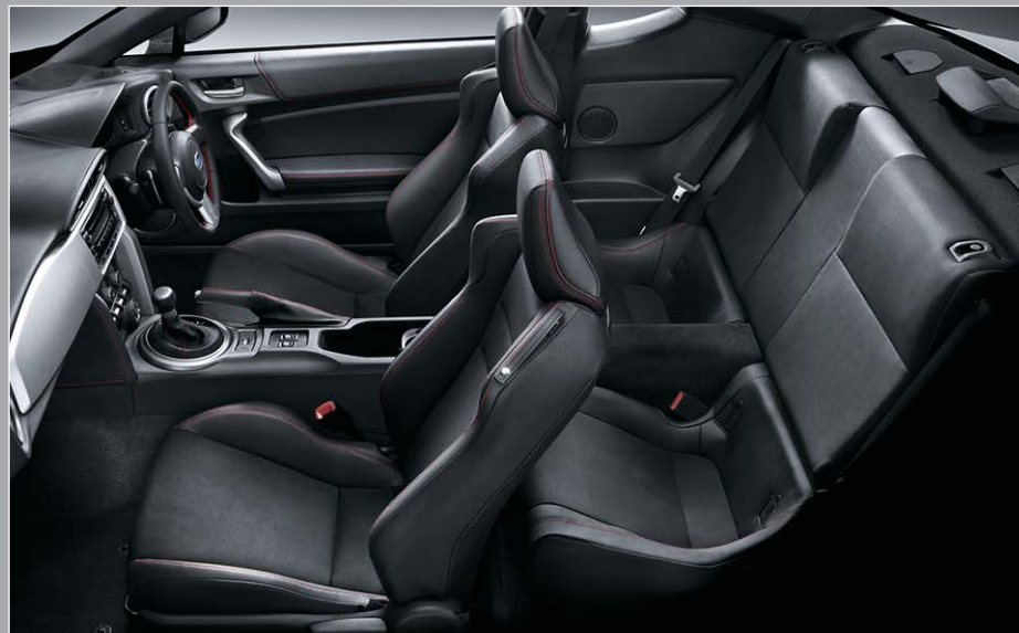
OPTIONAL: LEATHER 1 AND ALCANTARA