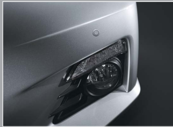
FRONT CORNER ASSIST 1