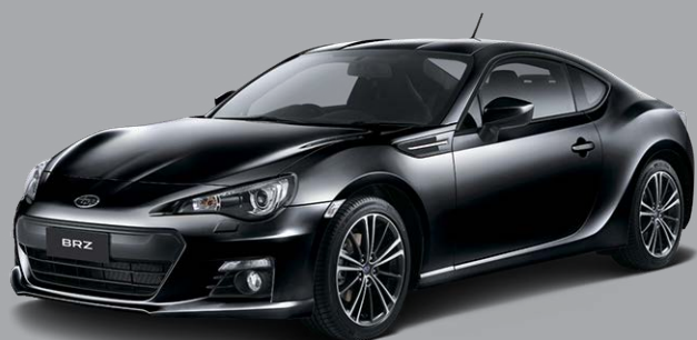
CRYSTAL BLACK SILICA