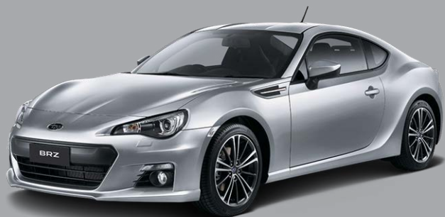
STERLING SILVER METALLIC