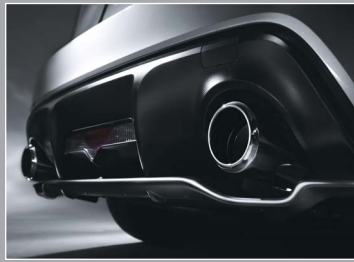
REAR UNDER DIFFUSER