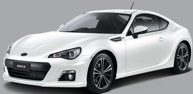
SATIN WHITE PEARL

One of the final choices – but one of the most important! The colour you choose for your Subaru BRZ makes a bold statement about who you are. So we've made sure you've got lots of ways to express yourself – with a wide range of colours to make your Subaru BRZ more... you.