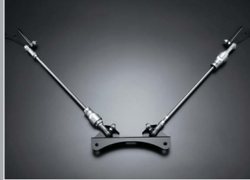
FLEXIBLE DRAW STIFFENER