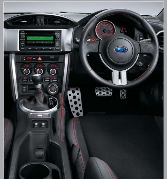
OPTIONAL: HEATED DRIVER AND FRONT PASSENGER SEATS