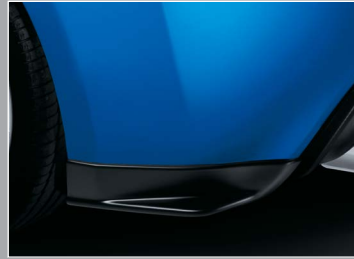
REAR SIDE UNDER SPOILER