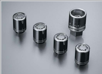
WHEEL LOCK NUTS