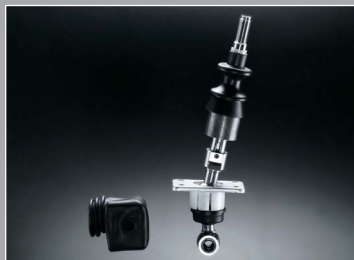
GEARSHIFT LEVER ASSEMBLY KIT 1