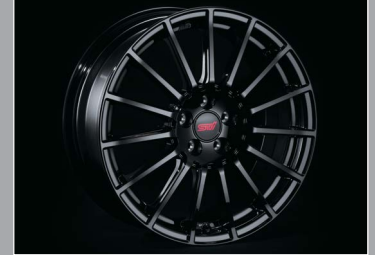
17" ALLOY WHEEL SET - BLACK