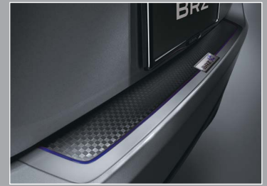
REAR STEP PANEL