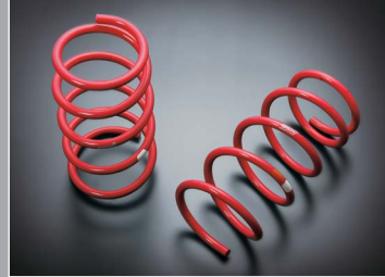
LOWERED COIL SPRING SET