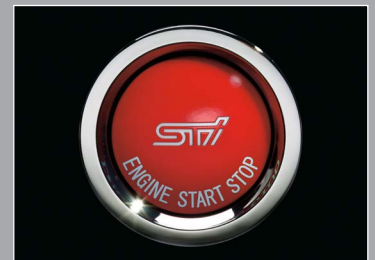
PUSH START ENGINE SWITCH