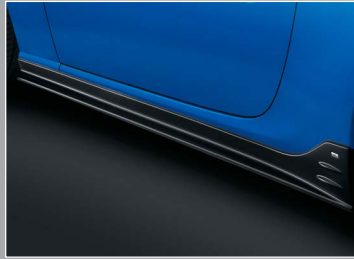
SIDE UNDER SPOILER