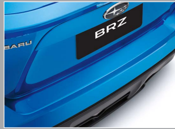
REAR BUMPER APPLIQUE