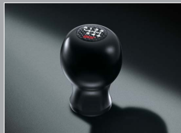
DURACON SHIFT KNOB 6MT 1