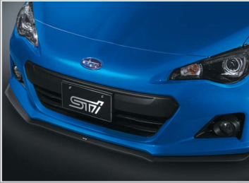
FRONT UNDER SPOILER