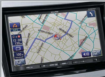
NAVIGATION UNIT 2