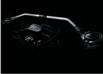
FLEXIBLE STRUT TOWER BAR