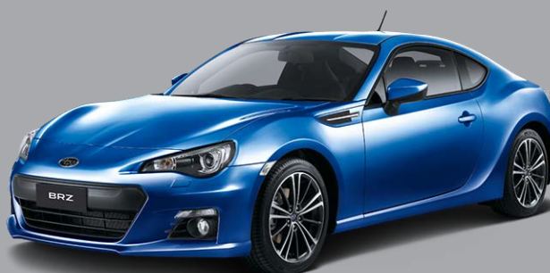
WR BLUE MICA (Subaru Exclusive)