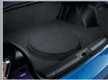
BOOT/SPARE WHEEL CARPET MAT