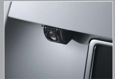
REVERSE CAMERA 3