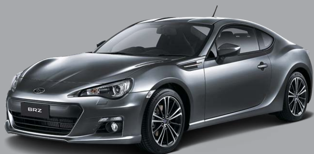
DARK GREY METALLIC