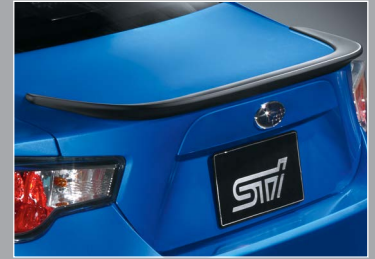
BOOT LIP SPOILER (CRYSTAL BLACK MICA)