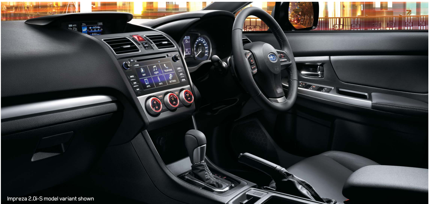
Impreza 2.0i-S model variant shown