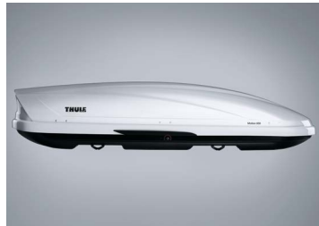
THULE MOTION 800 SILVER LUGGAGE POD 1