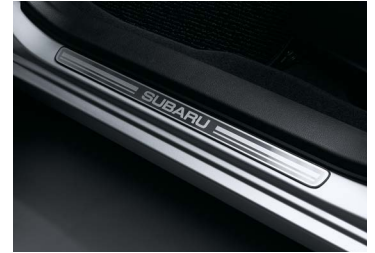
SIDE SILL PLATE