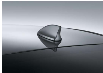
SHARK FIN ANTENNA