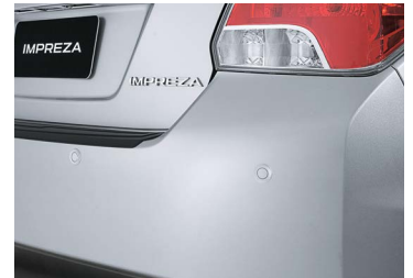
PARKING ASSIST (REAR)