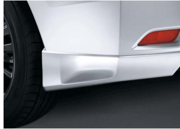
AERO MUD GUARD - REAR (2.0i-S ONLY)