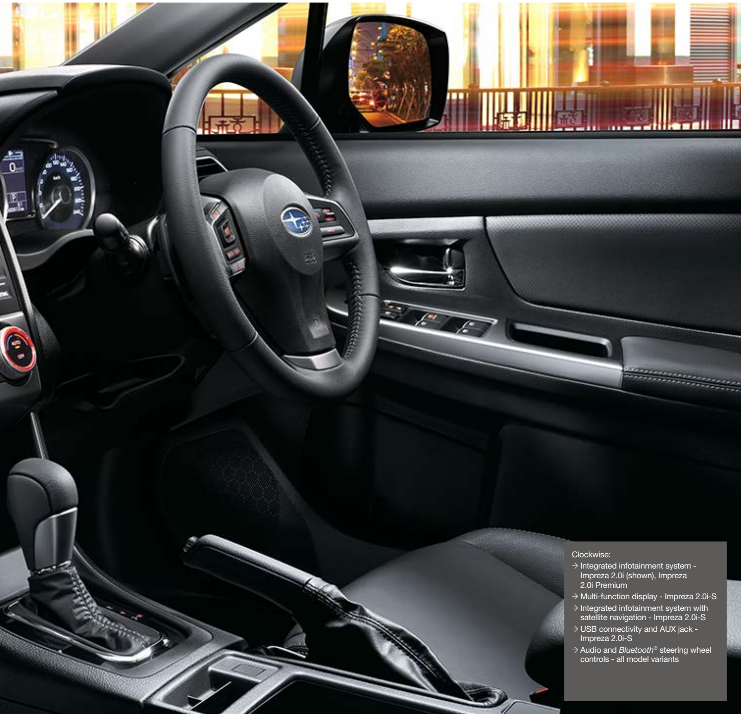
Clockwise: → Integrated infotainment system - Impreza 2.0i (shown), Impreza 2.0i Premium → Multi-function display - Impreza 2.0i-S → Integrated infotainment system with satellite navigation - Impreza 2.0i-S → USB connectivity and AUX jack - Impreza 2.0i-S → Audio and Bluetooth® steering wheel controls - all model variants