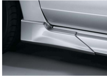
AERO MUD GUARD - FRONT (2.0i-S ONLY)