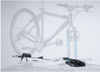
BICYCLE HOLDER 1 (FORK MOUNTED)