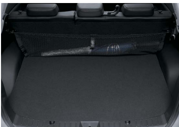
CARGO NET (REAR SEAT BACK)