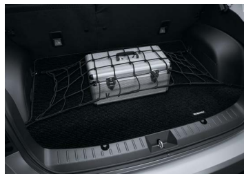
CARGO NET (FLOOR)