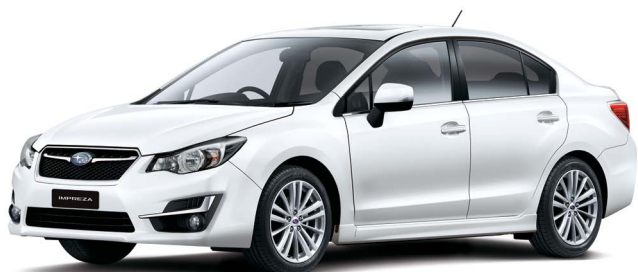
CRYSTAL WHITE PEARL

One of the final choices – but one of the most important! The colour you choose for your Impreza makes a bold statement about who you are. So we've made sure you've got lots of ways to express yourself – with a wide range of colours to make your Impreza more... you.