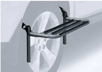
SIDE STEP UP