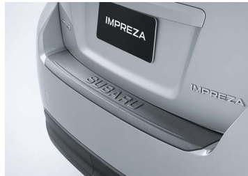
CARGO STEP PANEL - RESIN