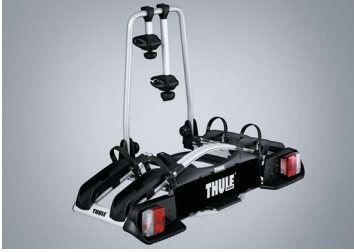
TOW BALL MOUNTED BIKE CARRIER (TWO BIKES)