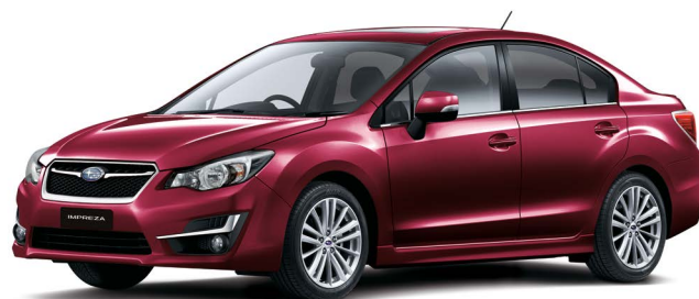
VENETIAN RED PEARL