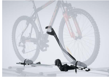
BICYCLE HOLDER 1 (UPRIGHT)