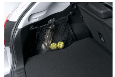
CARGO NET (SIDES)