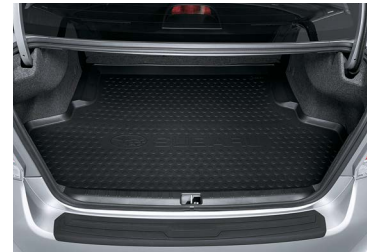
CARGO TRAY - SEDAN