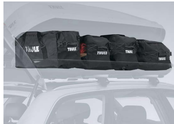
THULE GO PACK SET