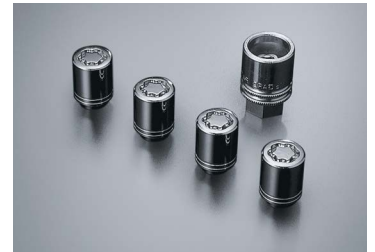
WHEEL LOCK NUTS