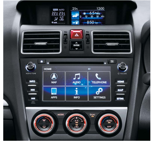
INTEGRATED INFOTAINMENT SYSTEM WITH SATELLITE NAVIGATION: Impreza 2.0i-S