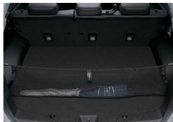
CARGO NET (REAR TAILGATE)