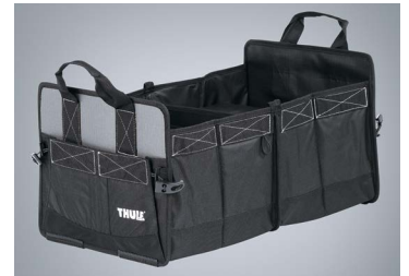
THULE GO BOX