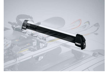
DELUXE 4 PAIR SKI HOLDER 1