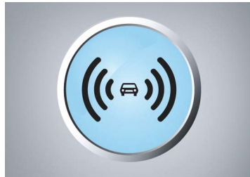
SECURITY ALARM SYSTEM