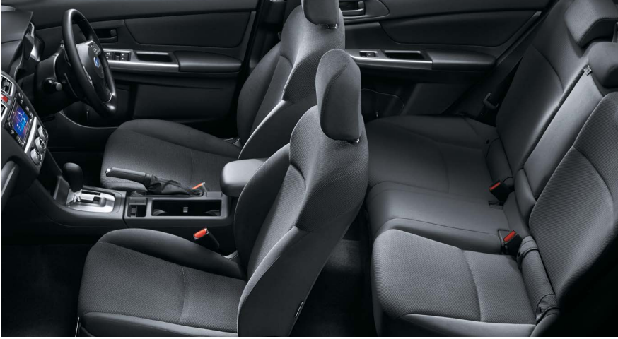
BLACK OR IVORY CLOTH: Impreza 2.0i