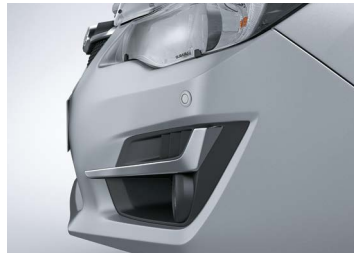
FRONT PARKING CORNER ASSISTANCE SYSTEM