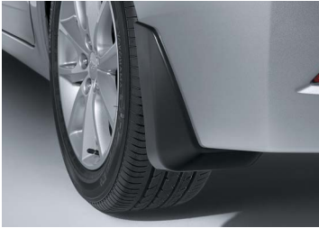
MUD GUARD SET