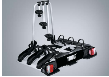
TOW BALL MOUNTED BIKE CARRIER (THREE BIKES)