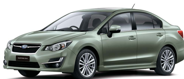
JASMINE GREEN METALLIC 1