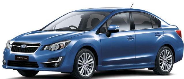
QUARTZ BLUE PEARL