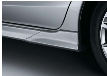
SIDE STRAKE (2.0i-S ONLY)