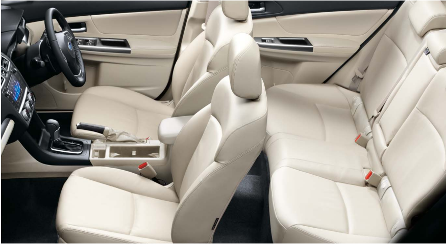
BLACK OR IVORY LEATHER: 1 Impreza 2.0i Premium and Impreza 2.0i-S