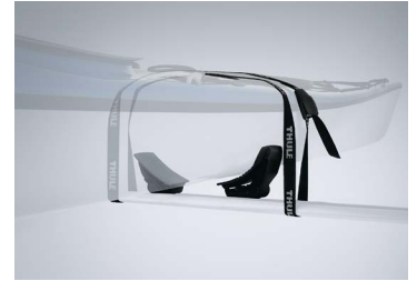
WATERCRAFT HOLDER 1