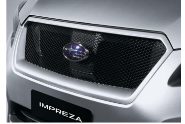
FRONT MESH GRILLE