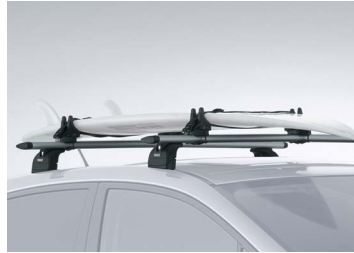
SURFBOARD CARRIER 1