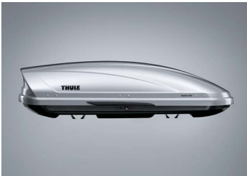
THULE MOTION 200 SILVER LUGGAGE POD 1