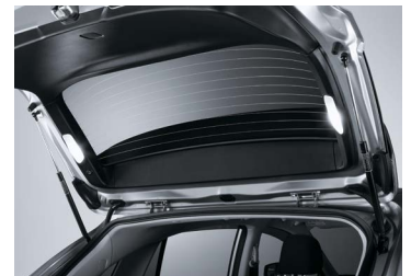
REAR HATCH LIGHT