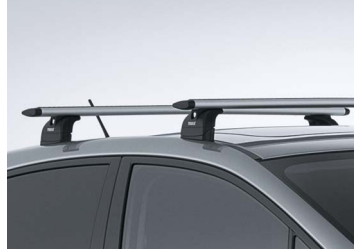
ROOF CROSS BARS