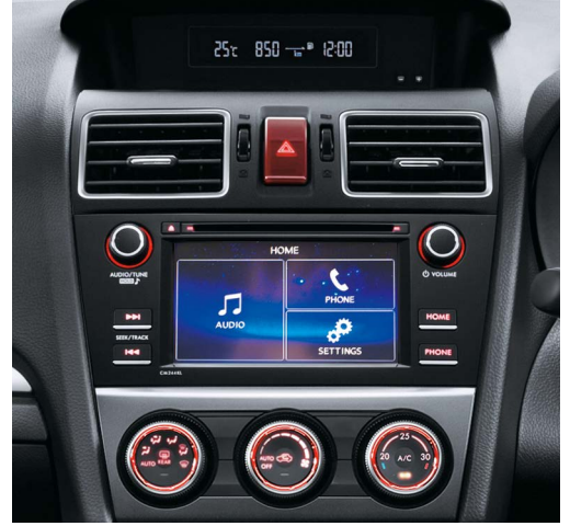
INTEGRATED INFOTAINMENT SYSTEM: Impreza 2.0i and Impreza 2.0i Premium