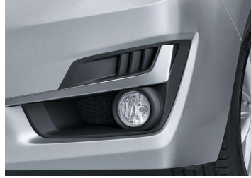
FOG LAMP KIT