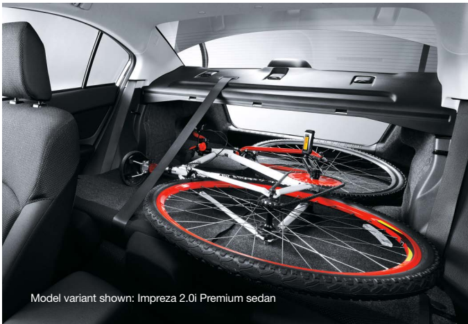
Model variant shown: Impreza 2.0i Premium sedan

Impreza's boot space is large and practical too. The 60/40 split-folding rear seats fold completely flat for an expansive extended luggage space, while the child restraint anchors in the hatch are located on the rear seat backs so the tether straps do not intrude into the boot cargo area. Boasting the sort of space and clever design features you would normally only expect in a much larger car, the Impreza delivers in spades.