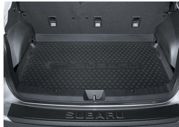
CARGO TRAY - HATCH