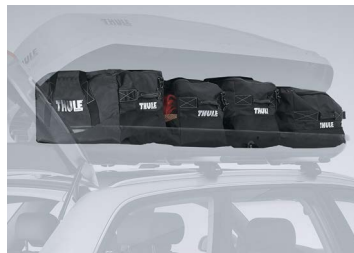
THULE GO PACK SET