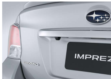
REAR REVERSE CAMERA