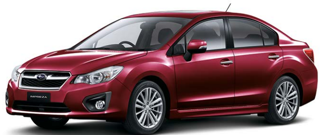
VENETIAN RED PEARL