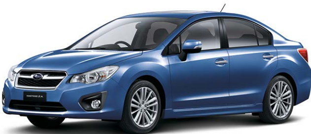
QUARTZ BLUE PEARL