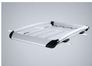
LUGGAGE RACK 1 (SMALL / LARGE)