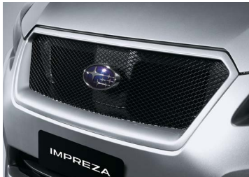
FRONT MESH GRILLE