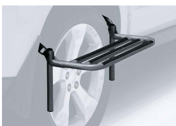
SIDE STEP UP