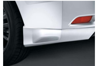
AERO MUDFLAP - REAR (IMPREZA 2.0i-S ONLY)