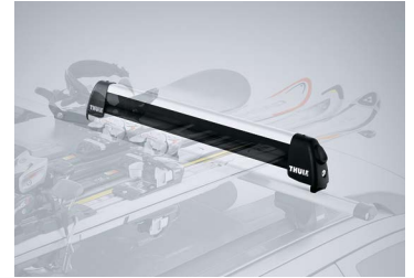
UNIVERSAL LOCKING ARMS 1