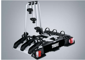
TOW BALL MOUNTED BIKE CARRIER (THREE BIKES)