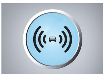
SECURITY ALARM SYSTEM