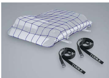
NET AND STRAPS FOR LUGGAGE RACK