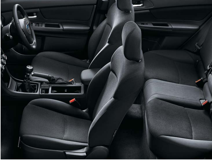
CLOTH: BLACK OR IVORY: IMPREZA 2.0i and IMPREZA 2.0i-L