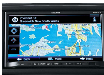
NAVIGATION UNIT 2