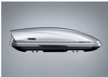
THULE MOTION 200 SILVER LUGGAGE POD 1