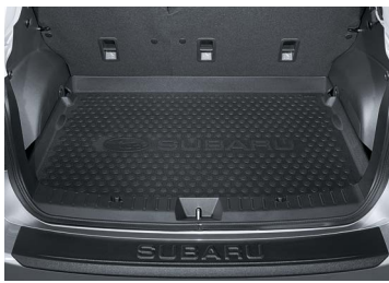
CARGO TRAY - HATCH