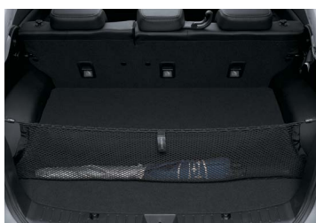
CARGO NET (REAR TAILGATE)