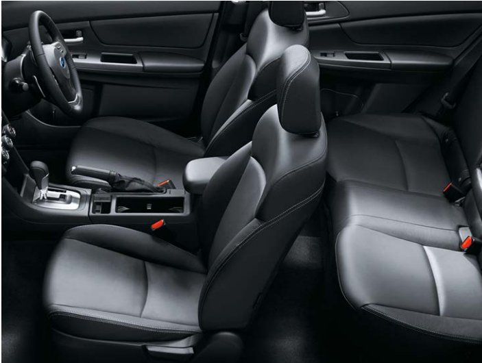
LEATHER: 1 BLACK OR IVORY: IMPREZA 2.0i-S