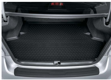
CARGO TRAY - SEDAN