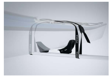
WATERCRAFT HOLDER 1