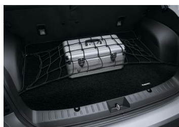
CARGO NET (FLOOR)