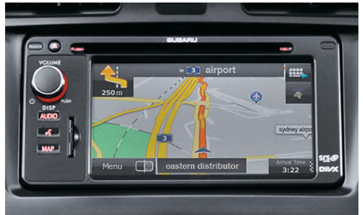
FACTORY FIT MULTI-INFORMATION IN-DASH SATELLITE NAVIGATION SYSTEM 2 : IMPREZA 2.0i-L AND IMPREZA 2.0i-S