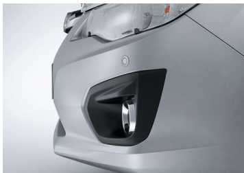
FRONT PARKING CORNER ASSISTANCE SYSTEM