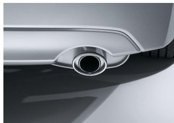
CHROME EXHAUST EXTENSION