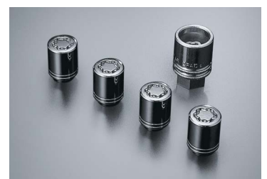
WHEEL LOCK NUTS