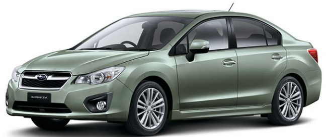
JASMINE GREEN METALLIC 1