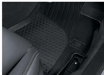
RUBBER MAT SET