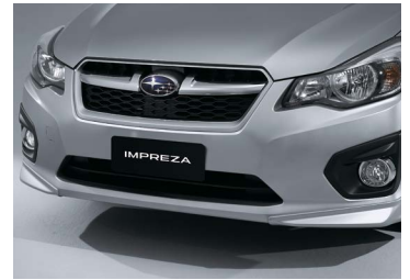
FRONT BUMPER SKIRT