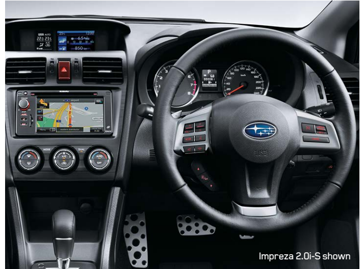
Impreza 2.0i-S shown