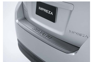
CARGO STEP PANEL - RESIN