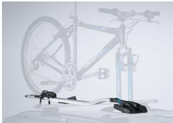
BICYCLE HOLDER 1 (FORK MOUNTED)