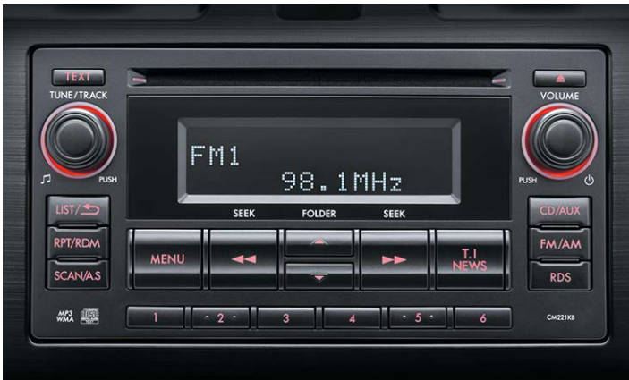
SINGLE IN-DASH CD PLAYER: IMPREZA 2.0i