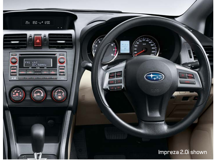
Impreza 2.0i shown