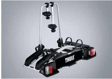
TOW BALL MOUNTED BIKE CARRIER (TWO BIKES)