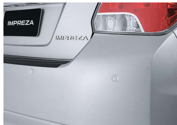
PARKING ASSIST (REAR)