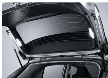
REAR HATCH LIGHT