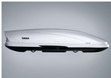
THULE MOTION 800 SILVER LUGGAGE POD 1