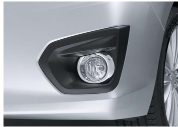
FOG LAMP KIT