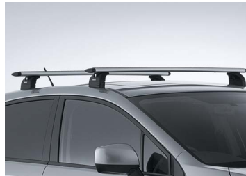
ROOF CROSS BARS