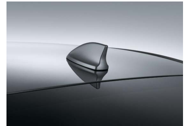
SHARK FIN ANTENNA