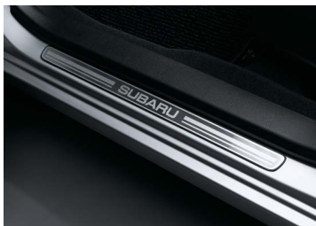
SIDE SILL PLATE