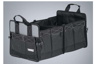
THULE GO BOX