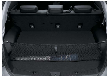
CARGO NET (REAR TAILGATE)

SUBARU.COM.AU FOR FULL DETAILS ON THE TAILOR-MADE ACCESSORIES AVAILABLE FOR YOUR SUBARU MODEL.