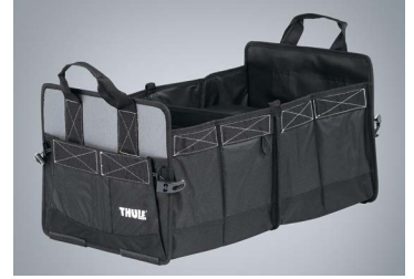
THULE GO BOX