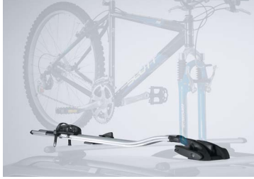
BICYCLE HOLDER (FORK MOUNTED)