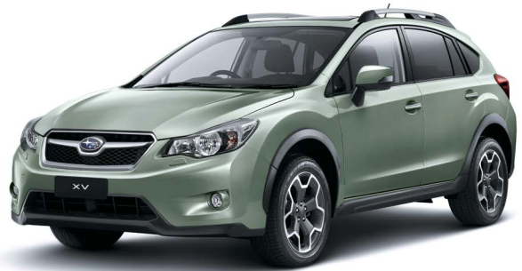
JASMINE GREEN METALLIC