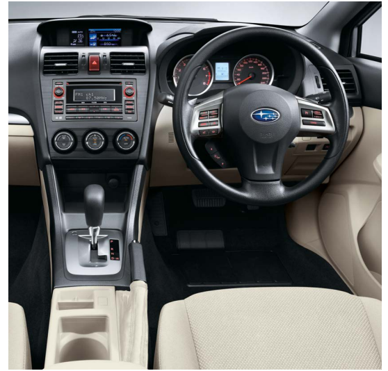
SUBARU XV 2.0i SHOWN