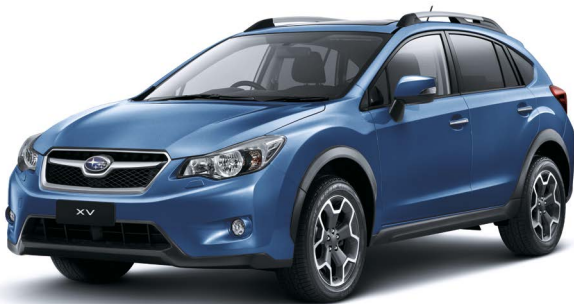
QUARTZ BLUE PEARL