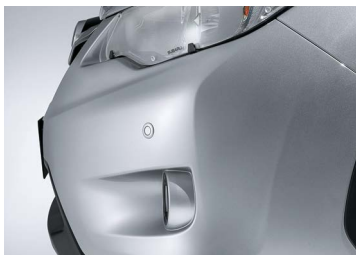
PARKING ASSIST (FRONT)