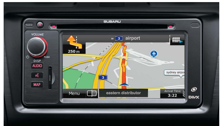
MULTI-INFORMATION IN-DASH SATELLITE NAVIGATION SYSTEM WITH 6.1-INCH TOUCH SCREEN, MP3/WMA/IPOD/DIVX COMPATIBLE, SINGLE CD PLAYER AND SIX SPEAKERS: SUBARU XV 2.0i-L AND SUBARU XV 2.0i-S