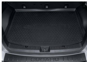
CARGO TRAY (LOW DISH)