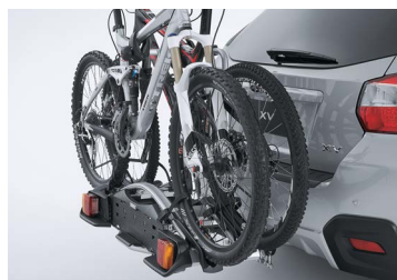
TOW BALL MOUNTED BIKE CARRIER (TWO BIKES)