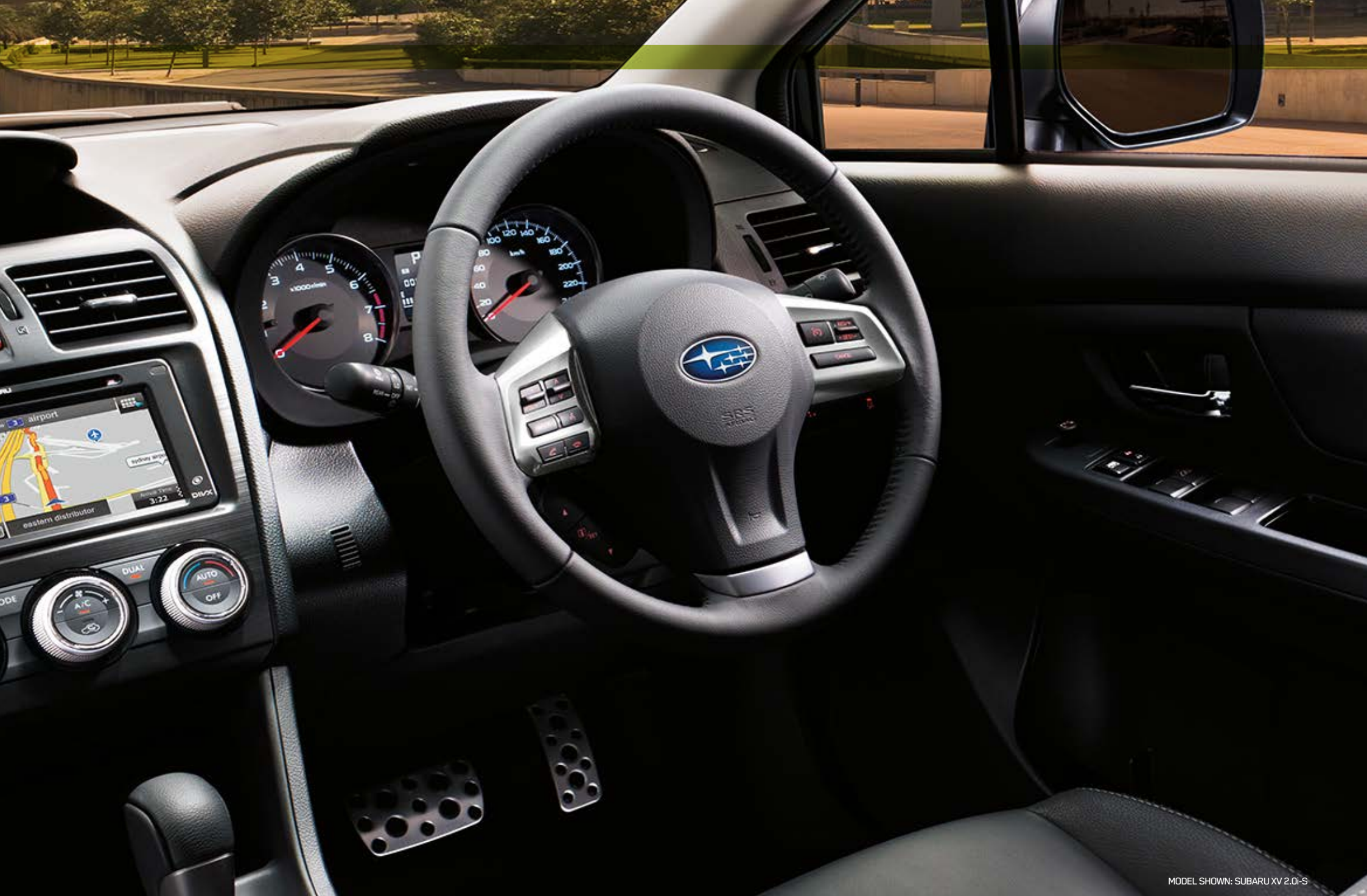
MODEL SHOWN: SUBARU XV 2.0i-S