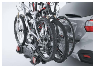
TOW BALL MOUNTED BIKE CARRIER (THREE BIKES)