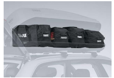
THULE GO PACK SET