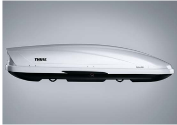
THULE MOTION 800 SILVER LUGGAGE POD