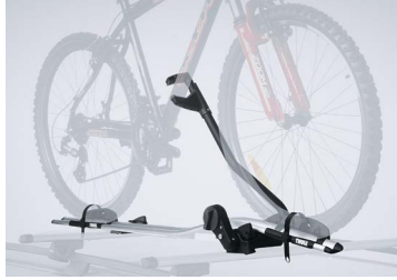
BICYCLE HOLDER (UPRIGHT)