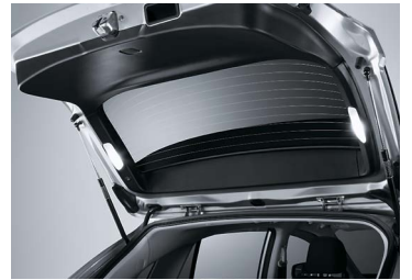
REAR HATCH LIGHTS