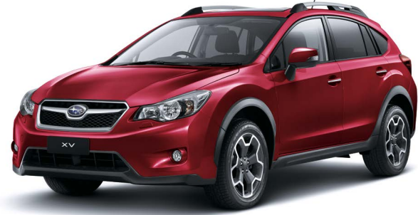
VENETIAN RED PEARL