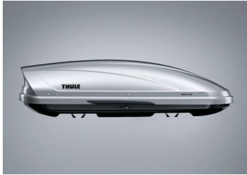
THULE MOTION 200 SILVER LUGGAGE POD