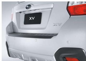
PARKING ASSIST (REAR)