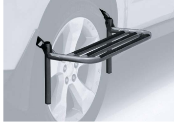
SIDE STEP UP