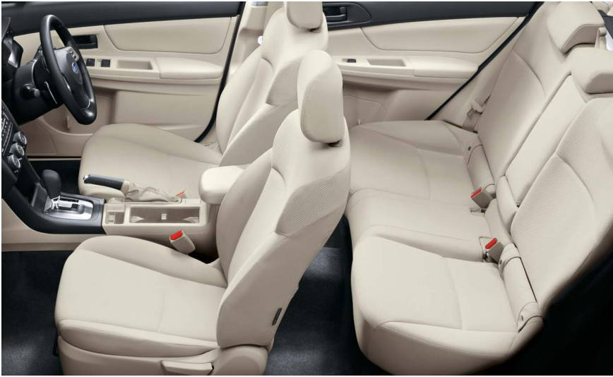
CLOTH: CHOICE OF BLACK OR IVORY: SUBARU XV 2.0i AND SUBARU XV 2.0i-L