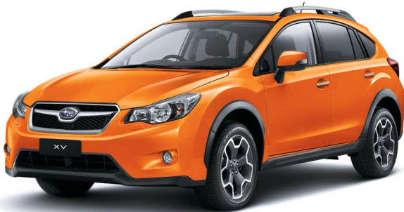
TANGERINE ORANGE PEARL