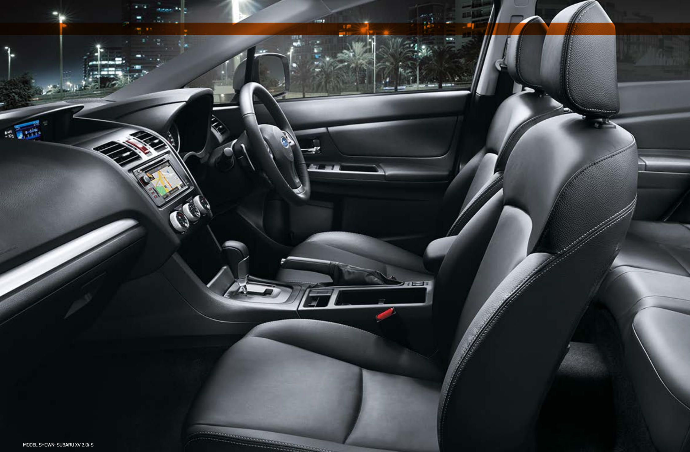
MODEL SHOWN: SUBARU XV 2.0i-S