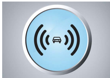
SECURITY ALARM SYSTEM