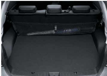
CARGO NET (REAR SEAT BACK)