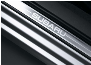
SIDE SILL PLATE