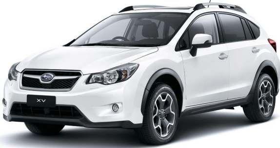
SATIN WHITE PEARL

Always check with your authorised Subaru Retailer regarding colour availability of your selected model before purchase.