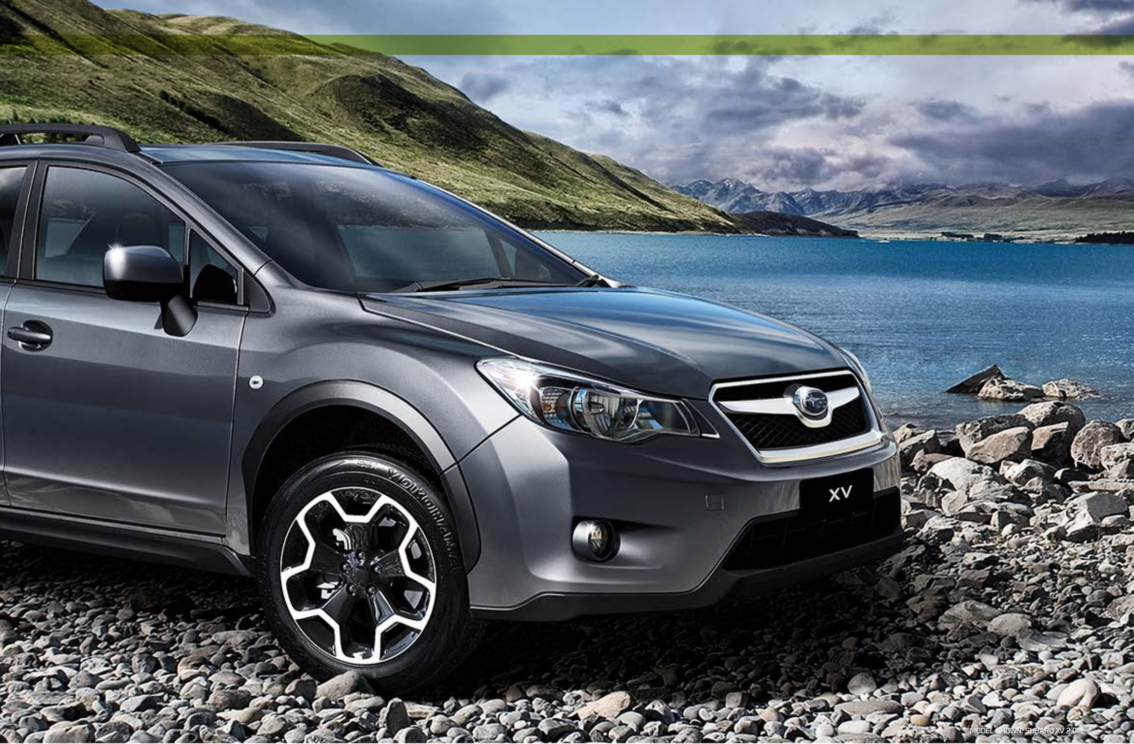
MODEL SHOWN: SUBARU XV 2014