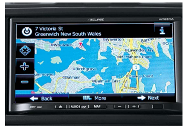
AVN NAVIGATION SYSTEM 2