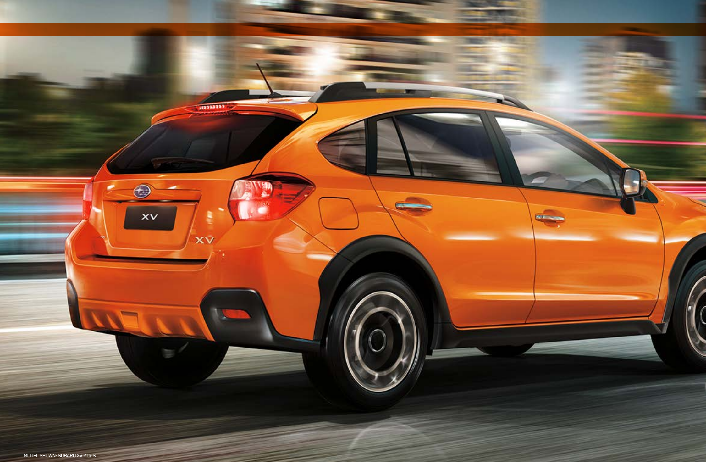
MODEL SHOWN: SUBARU XV 2.0i-S