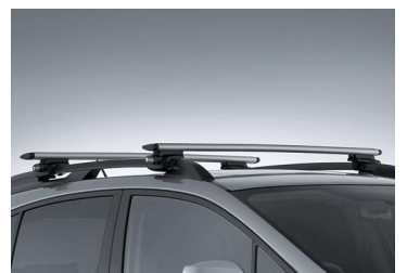
ROOF CROSS BARS