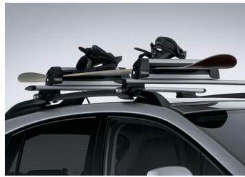
UNIVERSAL LOCKING ARMS