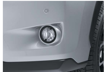
FOG LAMP PROTECTOR