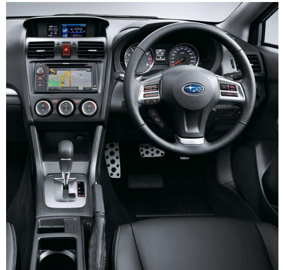
SUBARU XV 2.0i-S SHOWN