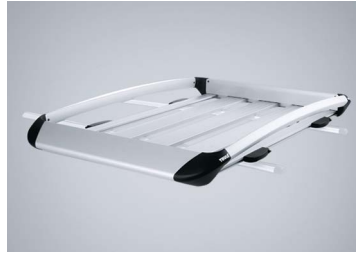
LUGGAGE RACK (SMALL AND LARGE)