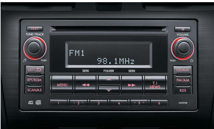
SINGLE IN-DASH CD PLAYER: SUBARU XV 2.0i