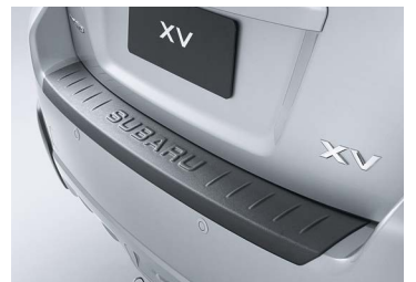
CARGO STEP PANEL (RESIN)