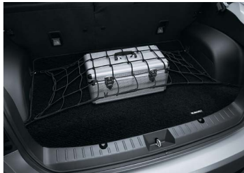
CARGO NET (FLOOR)