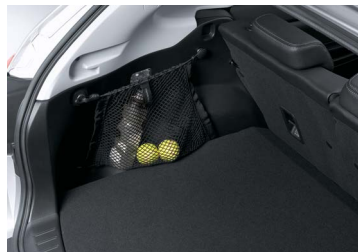
CARGO NET (SIDES)