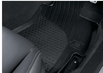
RUBBER MAT SET