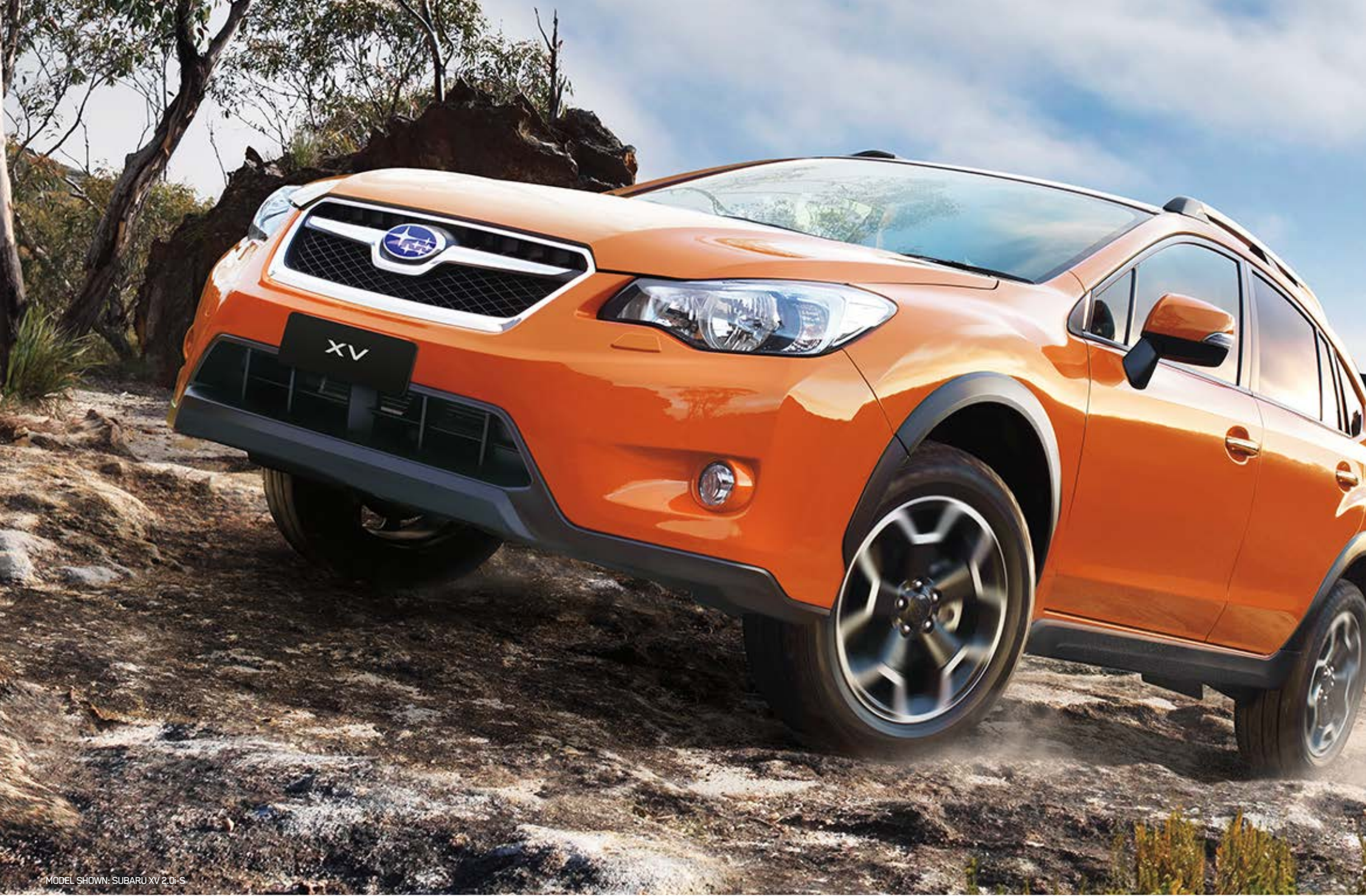
MODEL SHOWN: SUBARU XV 2.0i-S