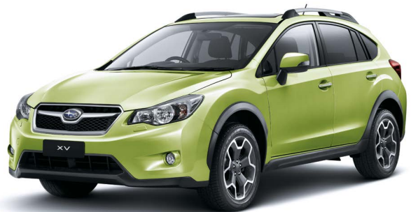
PLASMA GREEN PEARL