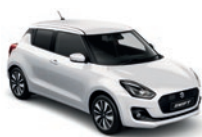
Pure White Pearl