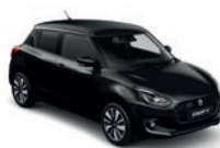
Super Black 1