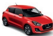
Burning Red 1