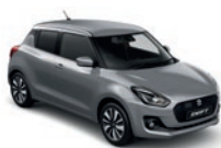
Premium Silver 1