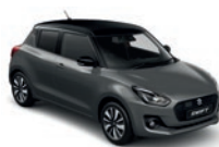
Mineral Grey / Black Roof 1