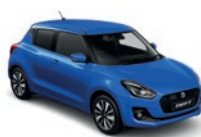
Speedy Blue 1