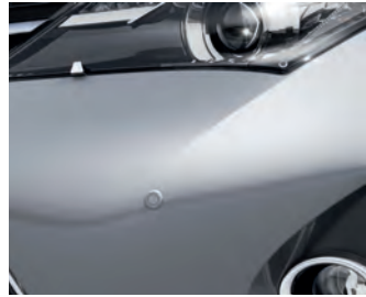
Park Assist 2 Clearance Parking Sensors (4 Head Kit)