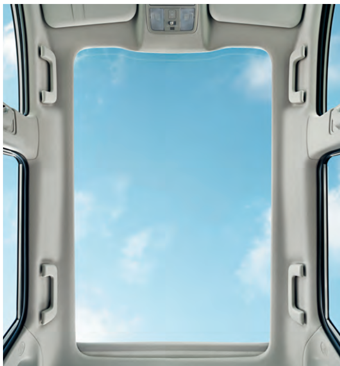
Levin ZR with optional Skyview™ roof shown.

The Corolla Hatch has a spacious interior that's designed with your life in mind. You can take advantage of the increased luggage space and extra legroom for rear seat passengers when you're being social and then simply fold flat all, or just part, of the 60:40 split-fold rear seat back when it's more cargo space you're after.