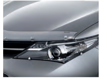
Bonnet Protector and Headlamp Covers 3 (sold separately)