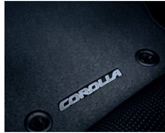
Carpet Floor Mats