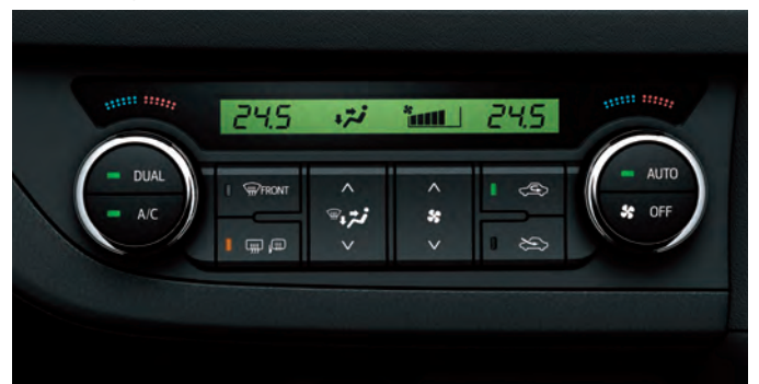
Levin ZR Dual-zone automatic climate control.