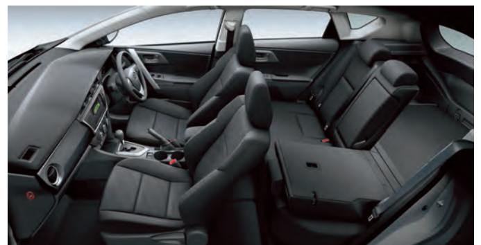
60:40 rear split (Ascent model shown).