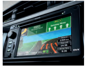
Audio Visual Unit with Satellite Navigation 4