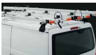
Roof Racks – Full Technician Kit Available on LWB