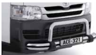
Alloy Nudge Bar & Headlamp Covers (Sold separately)

HiAce featured is accessorised with Full Technician Kit Roof Racks, Alloy Nudge Bar, Cargo Barrier, Front Weathershields and Headlamp Covers. (Sold separately.)