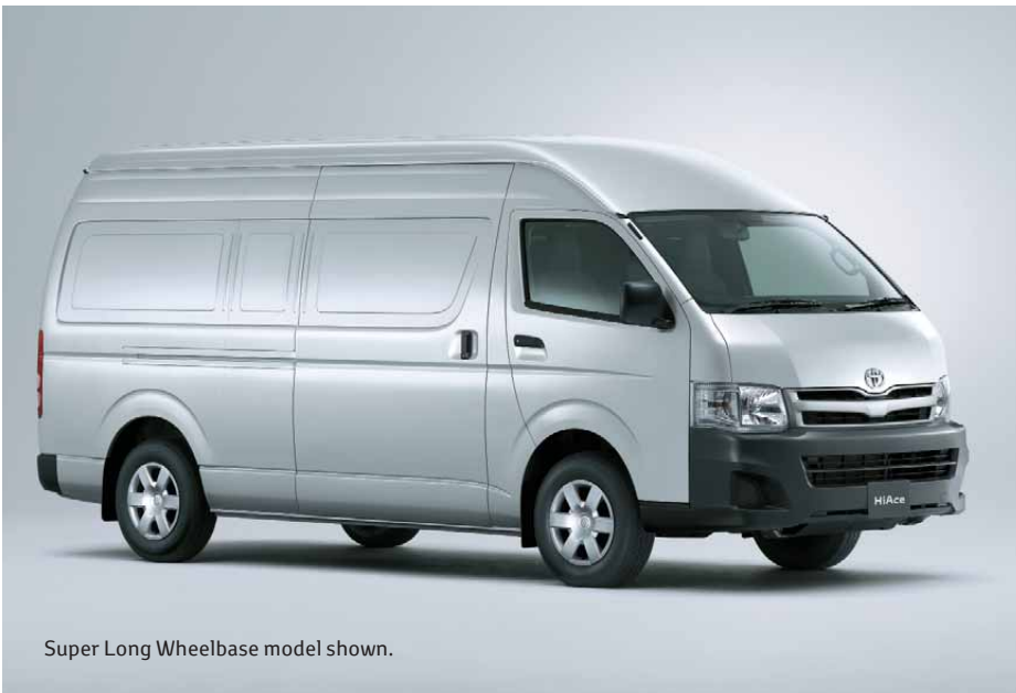
Super Long Wheelbase model shown.