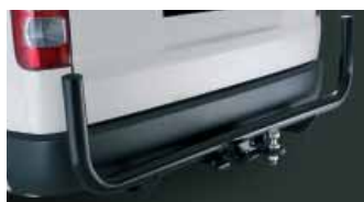
Towbar with Rear Corner Protector 2 Available on LWB. (Requires Towball and Trailer Wiring harness. Sold separately.)