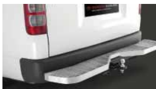
Towbar with Technician Step 2 Available on LWB. (Requires Towball and Trailer Wiring harness. Sold separately.)