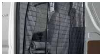
Cargo Barrier Available on LWB & SLWB