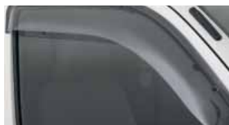
Front Weathershields (Sold separately)