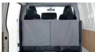
Air Conditioning Curtain Available on LWB