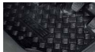
All Weather Rubber Floor Mats