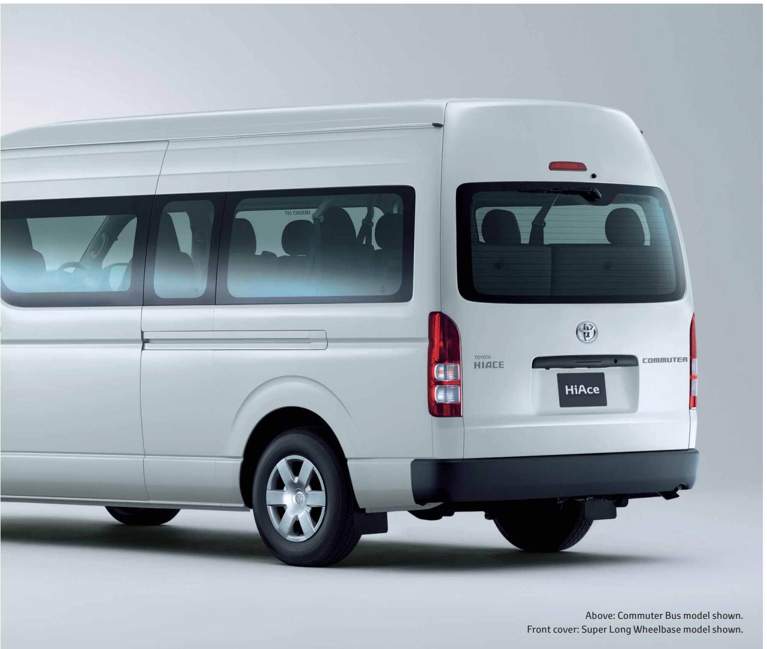
Above: Commuter Bus model shown. Front cover: Super Long Wheelbase model shown.