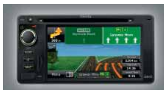
Audio Visual Unit with Satellite Navigation 4

IMPORTANT NOTICE: Some Toyota Genuine Accessories are not applicable to all models/grades. Please also consider the mass of your load to ensure you will not exceed the maximum allowable individual axle capacity, Gross Vehicle Mass and/or Gross Combined Mass of the vehicle, Refer to the Accessories brochure (available from your Toyota salesperson) or visit toyota.com.au/vehiclepayload for details on warranty and which Accessories are suitable for your vehicle. Pictured accessories are sold separately. Accessory colours shown may vary from actual colour due to the printing process.