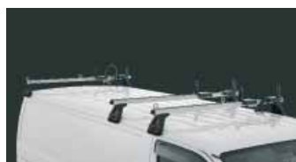
Roof Racks – Standard Kit 1 Available on LWB