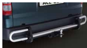
Towbar with Rear Step & Protector 2 Available on LWB. (Requires Towball and Trailer Wiring harness. Sold separately.)