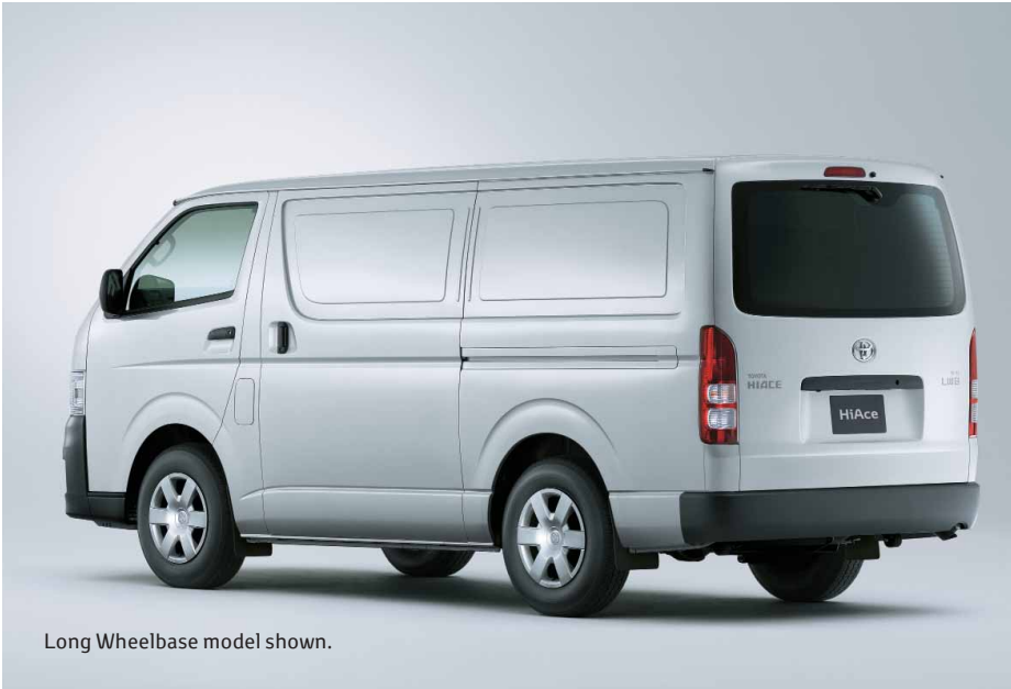
Long Wheelbase model shown.