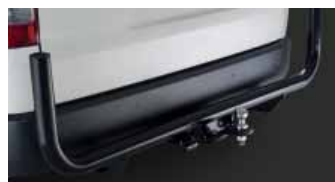
Park Assist Reverse parking sensors. 3 Towbar with Rear Corner Protector sold separately.