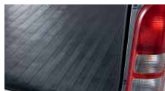
Cargo Mat Available on LWB