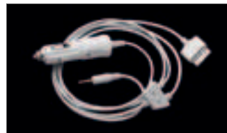
AUDIO CABLE AND CAR CHARGER FOR IPOD®** Available for all vehicles with Auxiliary Input