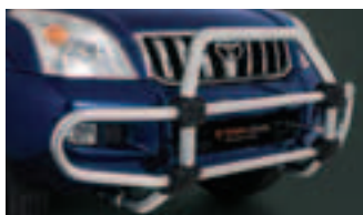
OVERBUMPER BULL BAR (AIRBAG COMPATIBLE)