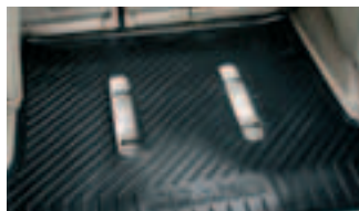
ALL WEATHER RUBBER CARGO MAT