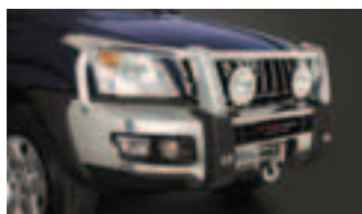
SOVEREIGN ALLOY BULL BAR AND SUPERWINCH – SOLD SEPARATELY (AIRBAG AND WINCH COMPATIBLE)

THESE ARE JUST SOME OF THE ACCESSORIES AVAILABLE FOR YOUR PRADO. FOR A COMPLETE LIST AND FURTHER DETAILS, PLEASE SEE YOUR TOYOTA DEALER OR REFER TO OUR WEBSITE.