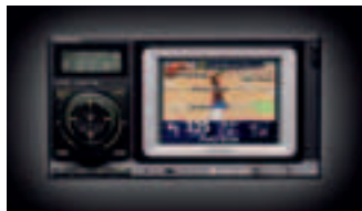
FOLLOWME SOUND AND NAVIGATION SYSTEM™ – INCLUDES SINGLE IN-DASH MP3 CD CHANGER & RADIO WITH BLUETOOTH™ HANDSFREE COMMUNICATIONS, USB IN AND (OPTIONAL) IPOD® CONTROL‡