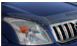
BONNET PROTECTOR & HEADLAMP COVERS (SOLD SEPARATELY)