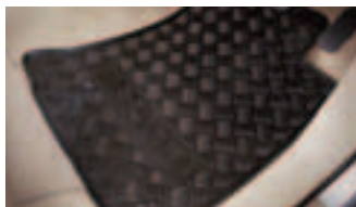
ALL WEATHER RUBBER FLOOR MATS