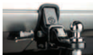
TOWBAR, TOWBALL & TRAILER WIRING HARNESS†