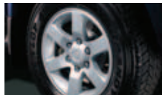
PHOENIX ALLOY WHEELS (17" X 75")