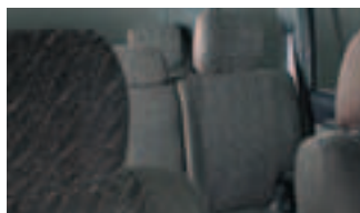
SEAT COVERS Available on Standard, GX and GXL (Not compatible with optional front seat side airbags or leather seats)