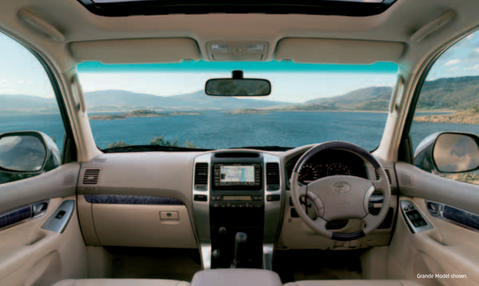
Grande Model shown.