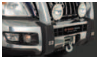
SUPERWINCH AND WINCH CRADLE