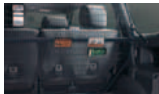
CARGO BARRIER Available on Standard and GX (Not compatible with optional curtain side airbags or optional rear air conditioning)