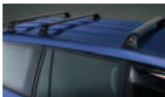
AERO ROOF RACKS (3 BAR SET SHOWN) Available on Standard and GX models only (Non Roof Rail only)