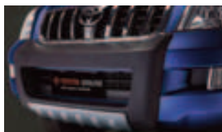
FRONT BUMPER GUARD (AIRBAG COMPATIBLE)