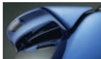
REAR ROOF SPOILER (Not compatible with Rear Visor)