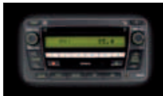
6 IN-DASH MP3 COMPATIBLE CD CHANGER & RADIO WITH BLUETOOTH™ HANDSFREE COMMUNICATIONS & AUXILIARY AUDIO INPUT Available on all models except Grande