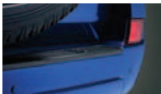
PARKASSIST#-REVERSE PARKING SENSORS (4-HEAD KIT)