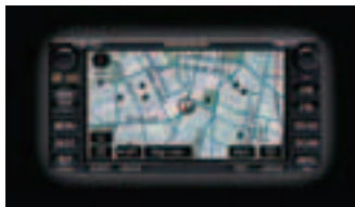
SATELLITE NAVIGATION AUDIO SYSTEM™ – INCLUDES 4 IN-DASH MP3 CD CHANGER & RADIO WITH BLUETOOTH™ HANDSFREE COMMUNICATIONS & (OPTIONAL) AUXILIARY AUDIO INPUT (OPTIONAL REAR VIEW CAMERA AVAILABLE†) Available on all models except Grande