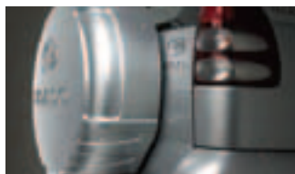
HARD COLOUR CODED SPARE WHEEL COVER Available on all models except Standard (Wide models only)