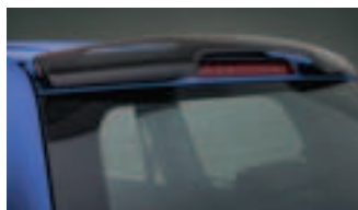
REAR VISOR (Not compatible with Rear Roof Spoiler)