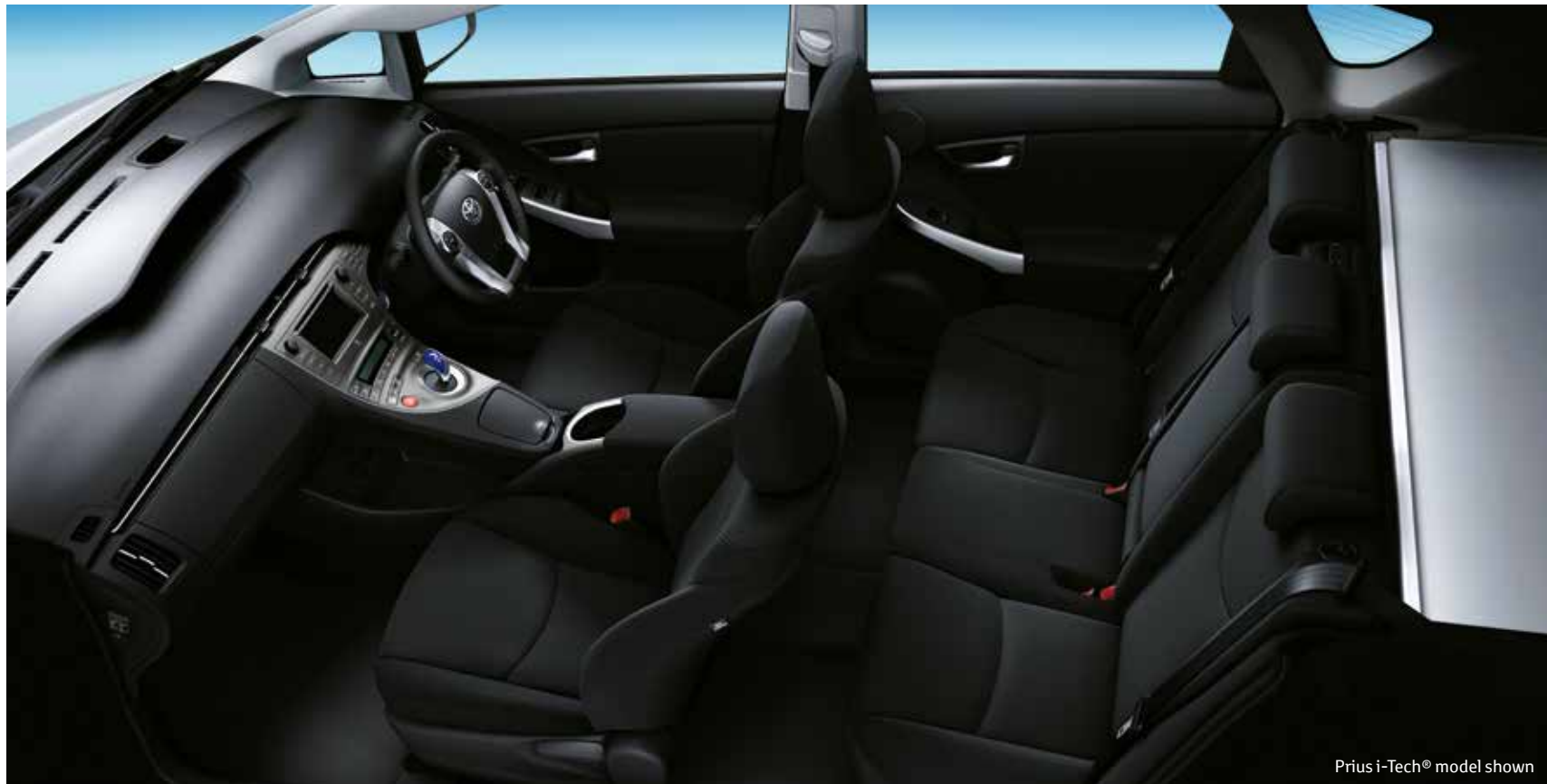
Prius i-Tech® model shown