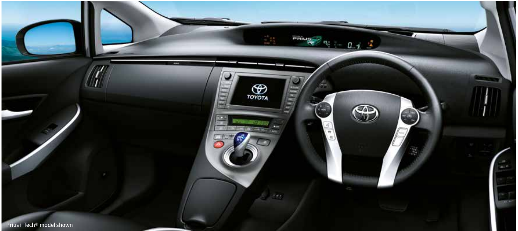
Prius i-Tech® model shown

And on the i-Tech® model, the Satellite Navigation 4 system can be programmed to provide both audio and on-screen directions to help you get you to your destination with a minimum of fuss.