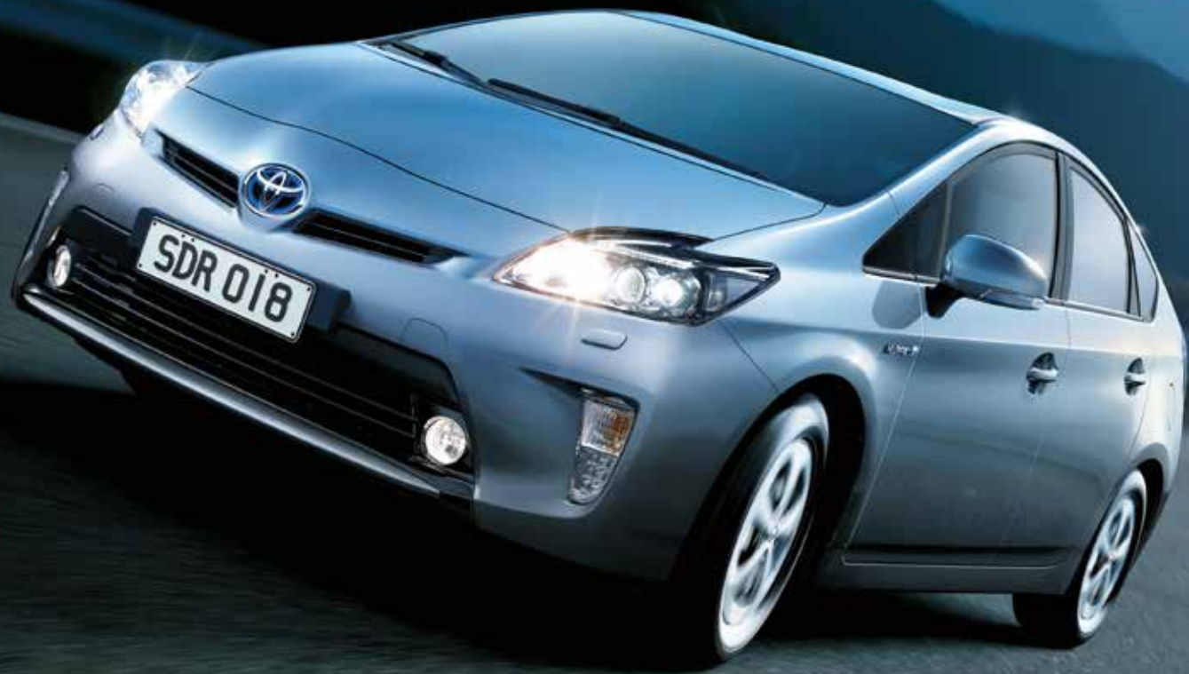
Prius i-Tech® model shown