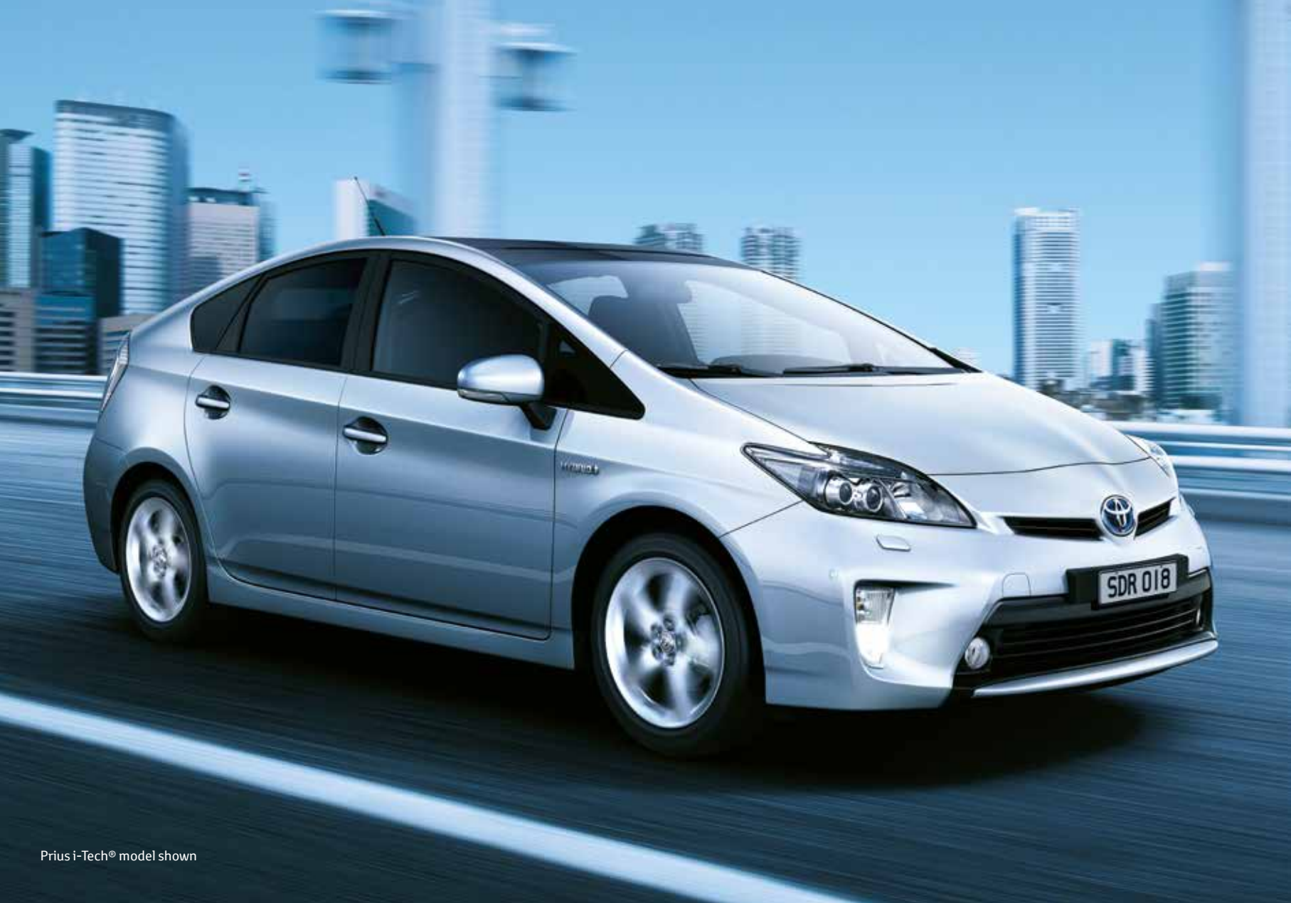
Prius i-Tech® model shown