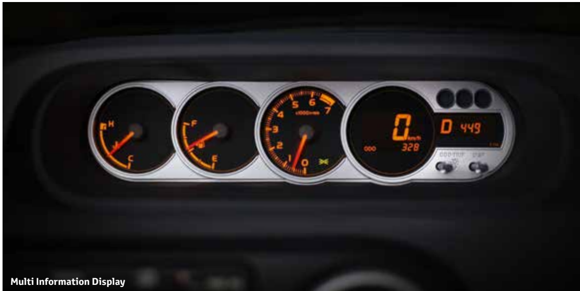
Multi Information Display