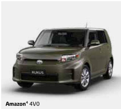
Amazon 4 4V0