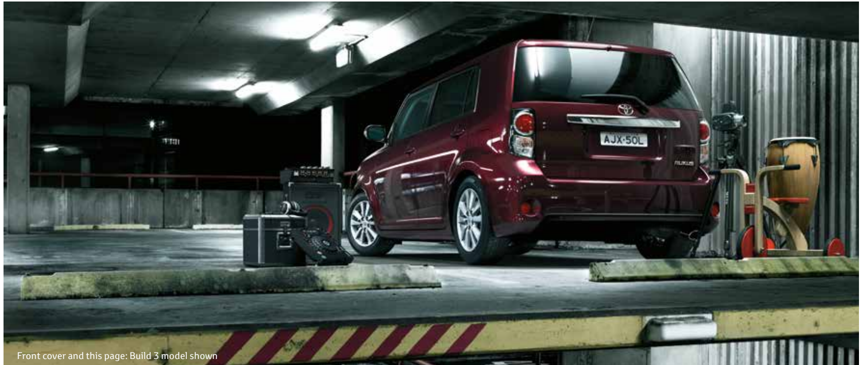
Front cover and this page: Build 3 model shown

On Build 3, you'll also be reaching for the stars through the one-touch tilt and slide moonroof.