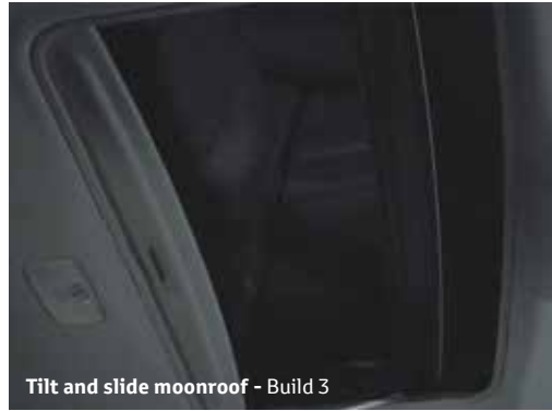
Tilt and slide moonroof - Build 3