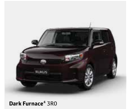
Dark Furnace 4 3R0