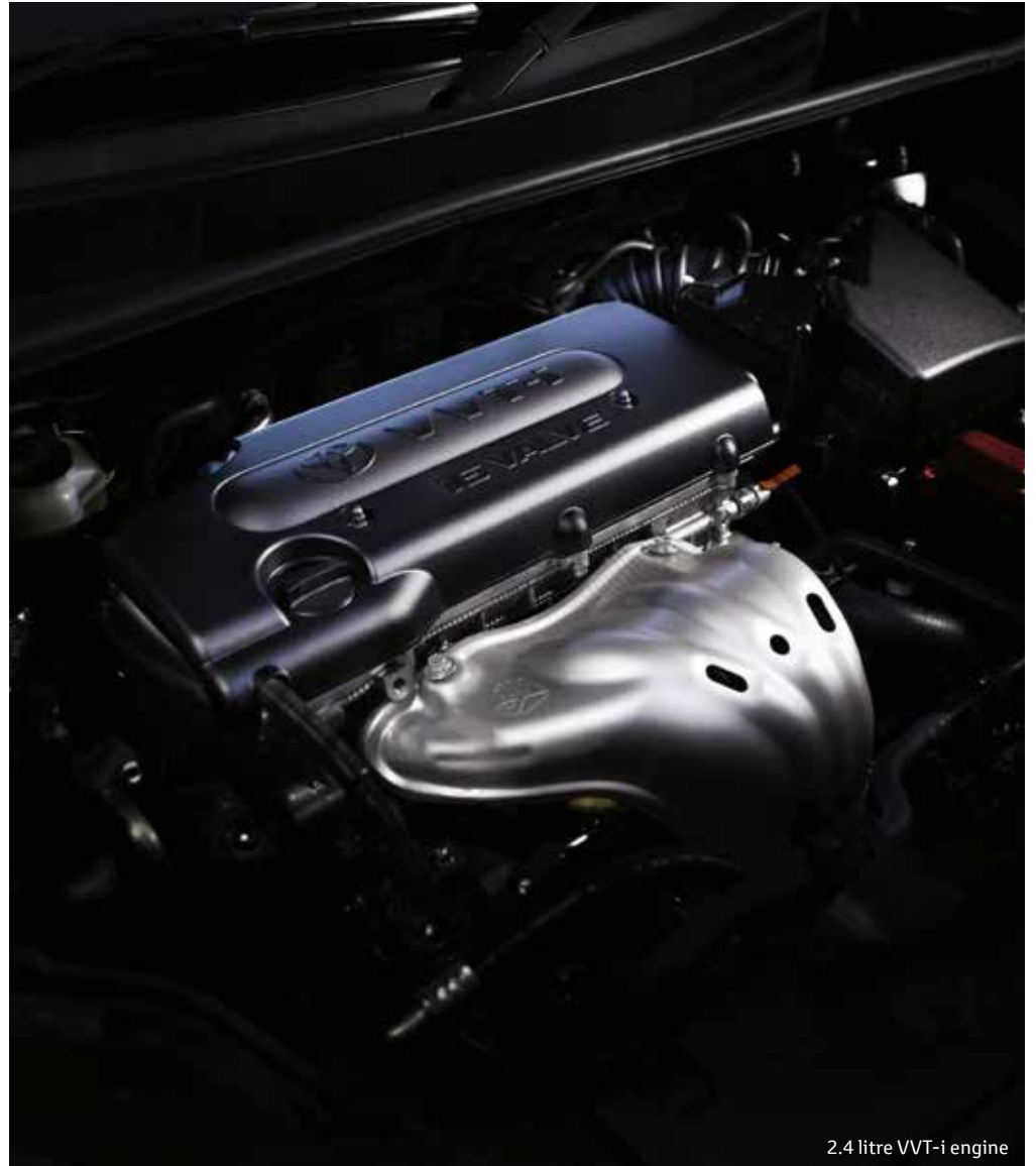
2.4 litre VVT-i engine

Rukus also comes with six SRS airbags, including driver and front passenger, front seat side and full-length curtain shield protection, to provide you with ultimate peace of mind.