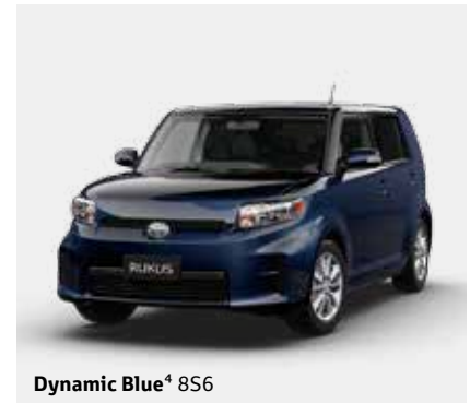
Dynamic Blue 4 8S6