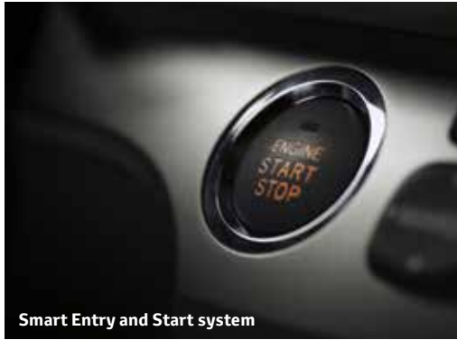
Smart Entry and Start system