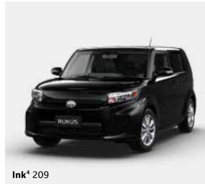
Ink 4 209