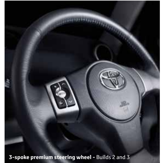
3-spoke premium steering wheel - Builds 2 and 3