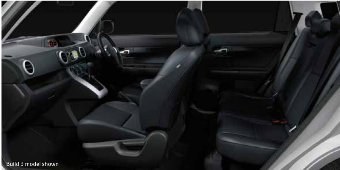
Build 3 model shown