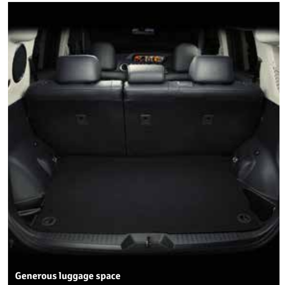
Generous luggage space