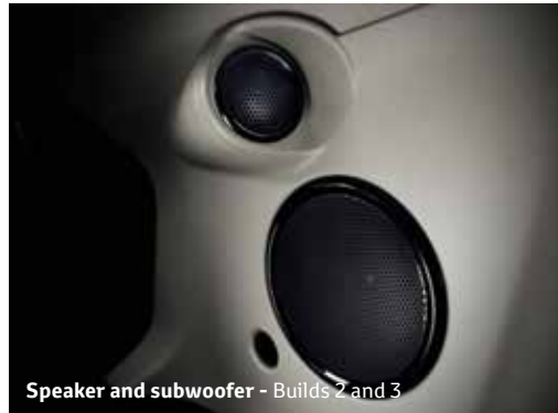
Speaker and subwoofer - Builds 2 and 3