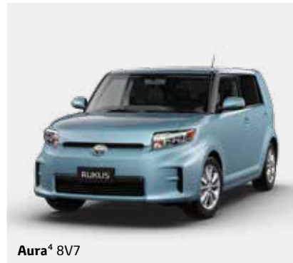
Aura 4 8V7