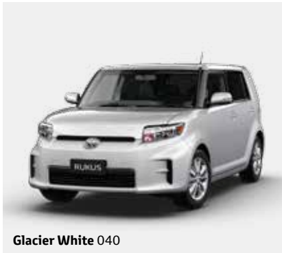
Glacier White 040