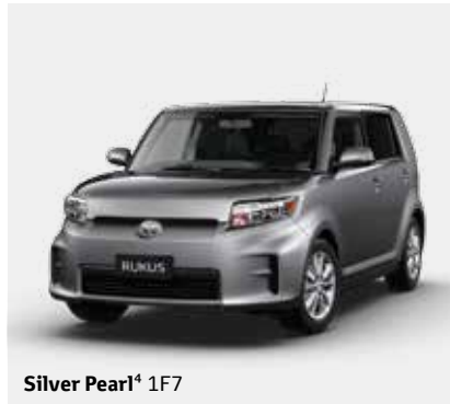
Silver Pearl 4 1F7