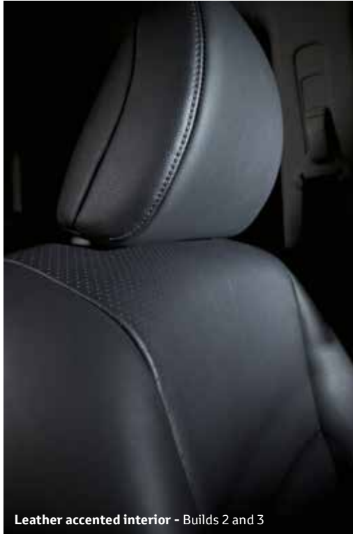
Leather accented interior - Builds 2 and 3