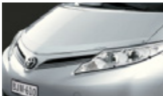
BONNET PROTECTOR & HEADLAMP COVERS (sold separately)

THESE ARE JUST SOME OF THE ACCESSORIES AVAILABLE FOR YOUR TARAGO. FOR A COMPLETE LIST AND FURTHER DETAILS, PLEASE SEE YOUR TOYOTA DEALER OR VISIT ACCESSORIES.TOYOTA.COM.AU