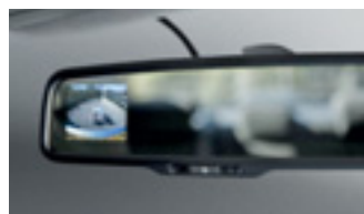
ELECTROCHROMATIC MIRROR & REAR VIEW CAMERA† (sold separately)