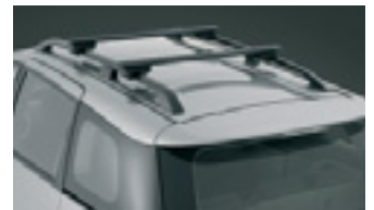
AERO ROOF RACKS (ROOF RAIL TYPE) Available on all GLX models