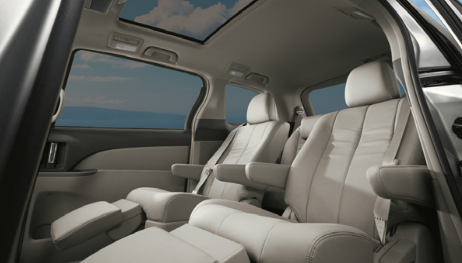
Ultima model shown.