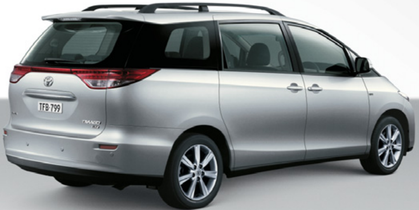
4 cylinder GLX model shown.