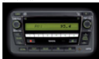
6 DISC IN-DASH MP3 COMPATIBLE CD CHANGER & RADIO WITH BLUETOOTH™†† COMMUNICATIONS & AUDIO INPUT Available on all GLi models