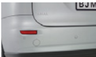
PARKASSIST-REVERSE PARKING SENSOR (4-HEAD KIT) SHOWN ON GLi** Available on all GLi models