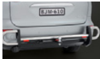
TOWBAR WITH REAR STEP & PROTECTOR, TOWBALL & TRAILER WIRING HARNESS* (sold separately)