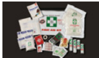
FAMILY MOTORIST FIRST AID KIT