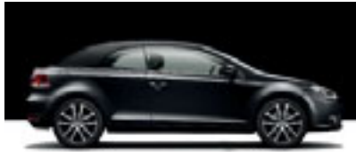
Deep Black Pearl Effect