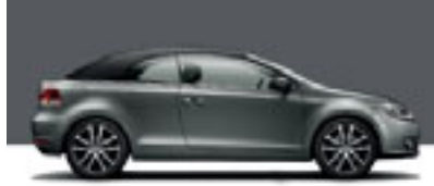
United Grey Metallic