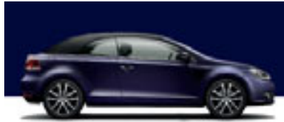
Dark Purple Metallic