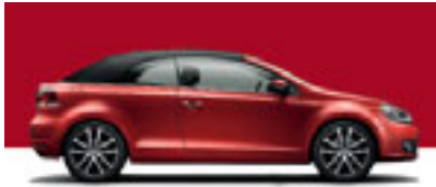
Sunset Red Metallic