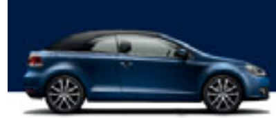
Night Blue Metallic