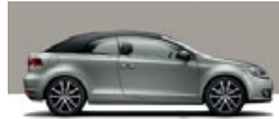
Tungsten Silver Metallic ▲

The vehicles depicted on this page are shown to illustrate the range of colours available in Australia but are otherwise overseas models used for illustrative purposes.