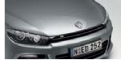
Reflex Silver Metallic