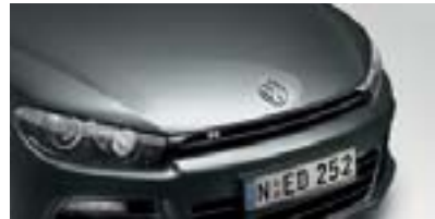
Indium Grey Metallic