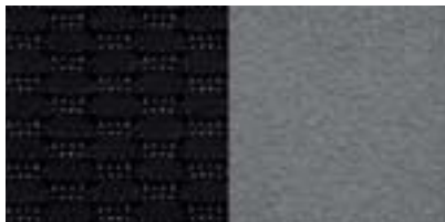
Kyalami black cloth with San Remo grey microfibre design

The print process does not allow for exact reproduction of the exterior or the upholstery colours. Please contact your Volkswagen Dealer for further information on colours and upholstery combinations.