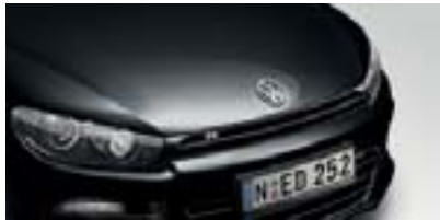
Deep Black Pearl Effect