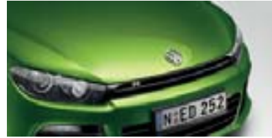
Viper Green Metallic