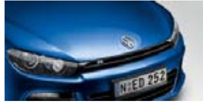
Rising Blue Metallic