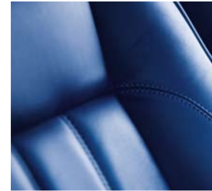
HIDE MATCHED TO CUSTOMER COLOUR SPECIFICATION