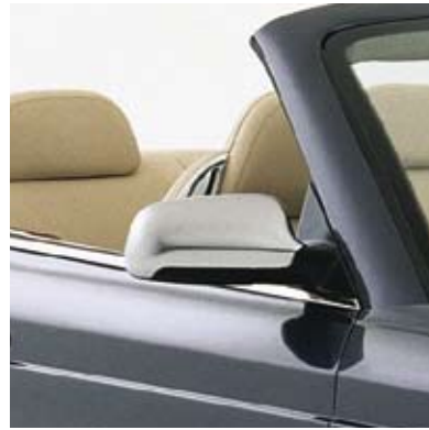
CHROME MIRROR CAPS