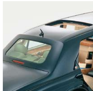
REAR COMPARTMENT ELECTRIC SUNROOF* (*RL ONLY)