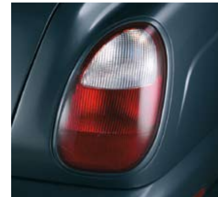
BODY COLOURED LAMP BEZELS