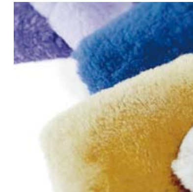
LAMBSWOOL RUGS MATCHED TO CUSTOMER COLOUR SPECIFICATION*