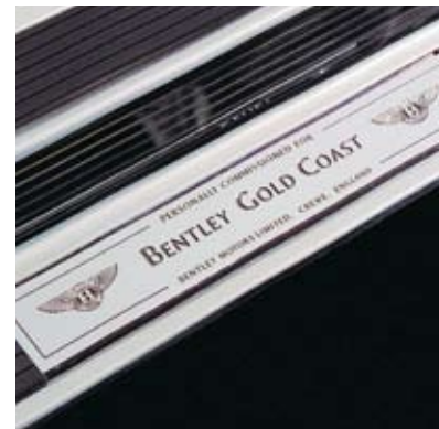
PERSONALISED TREAD PLATE PLAQUE