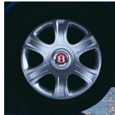
18"x8| 6-SPOKE CHROME PLATED ALUMINIUM ALLOY