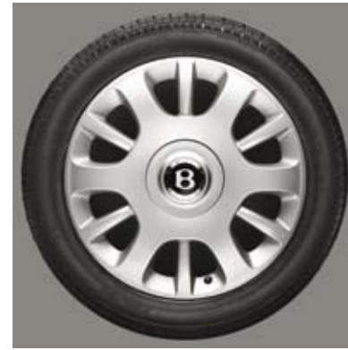
19"x8| 12-SPOKE ALUMINIUM ALLOY