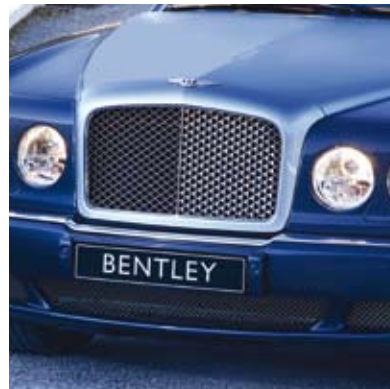
DUOTONE PAINT COMBINATION