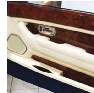
VENEERED DOOR PANELS

Not all features shown are available on Azure