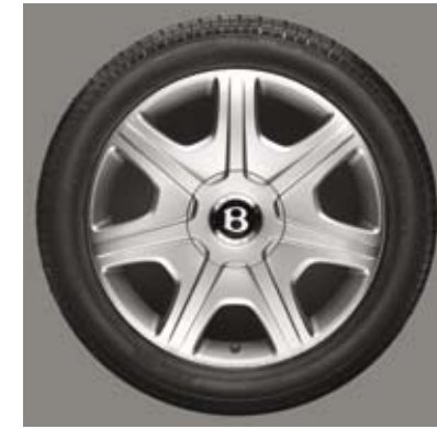
19"x8| 7-SPOKE ALUMINIUM ALLOY