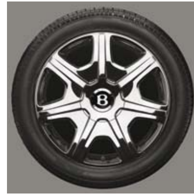
19"x8| 7-SPOKE CHROME PLATED ALUMINIUM ALLOY