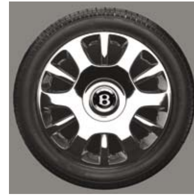
19"x8| 12-SPOKE CHROME PLATED ALUMINIUM ALLOY