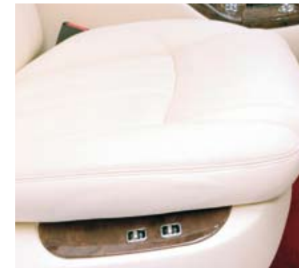
EXTENDED FRONT SEAT CUSHION**