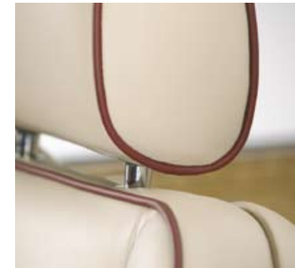
CONTRAST PIPING TO HEADREST AND SEAT