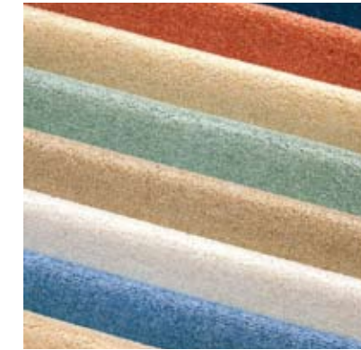
CARPETS MATCHED TO CUSTOMER COLOUR SPECIFICATION