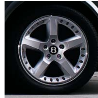
19"x8| 5-SPOKE 2-PIECE SPORTS 'BLADE' ALUMINIUM ALLOY (PAINTED)