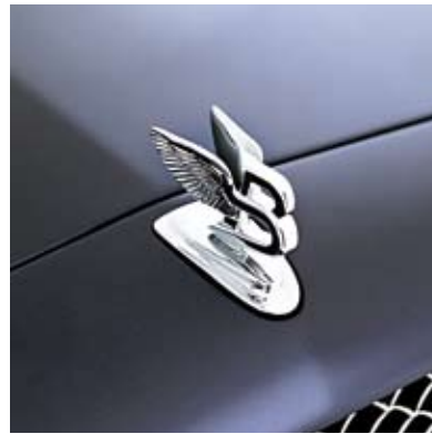
RETRACTABLE FLYING 'B' RADIATOR MASCOT