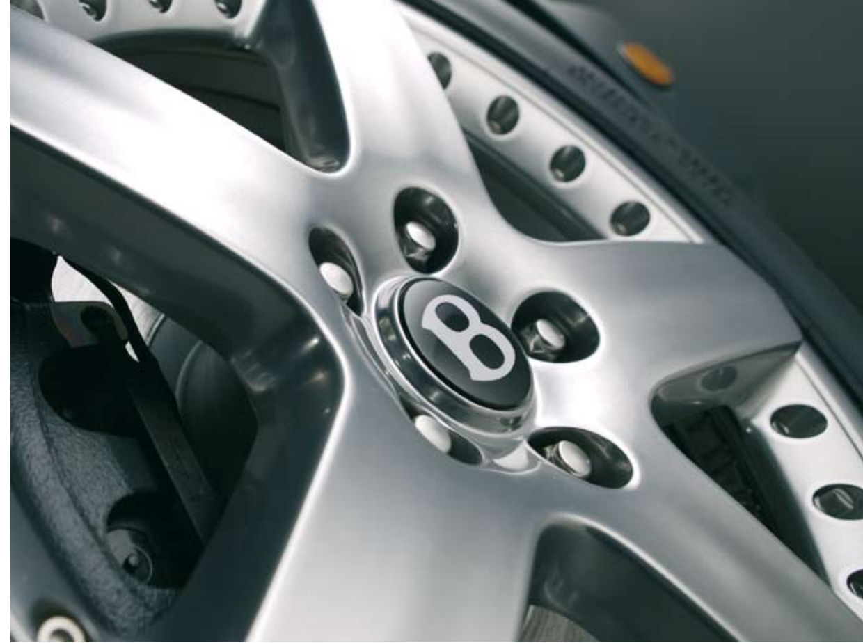
19"x8| 5-SPOKE 2-PIECE 'STAR' ALUMINIUM ALLOY (POLISHED)