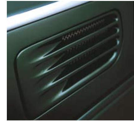
LOWER FRONT WING VENT