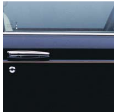
FINE LINES TO EXTERIOR BODYWORK