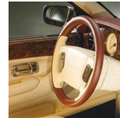
ARNAGE WITH TWO-TONE HIDE-TRIMMED MULTI-FUNCTION STEERING WHEEL (INTERIOR SHOWN IS BURGUNDY AND MAGNOLIA HIDE WITH BURR WALNUT VENEER)