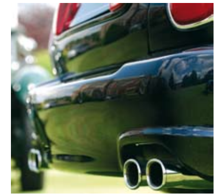
REAR SPORTS BUMPER AND QUAD EXHAUST TAILPIPES