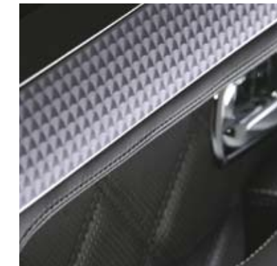
ENGINE-TURNED ALUMINIUM INSERTS TO WAIST RAILS