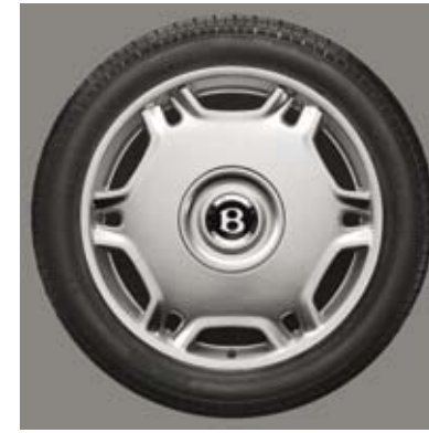
19"x8| 6 TWIN-SPOKE DISC ALUMINIUM ALLOY