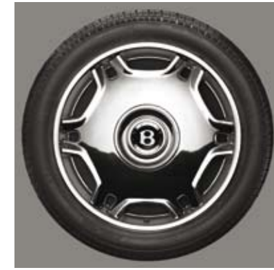
19"x8| 6 TWIN-SPOKE DISC ALUMINIUM ALLOY (CHROMED)