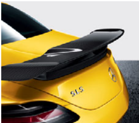
AMG Aerodynamics package (rear aerofoil) (Code B26)