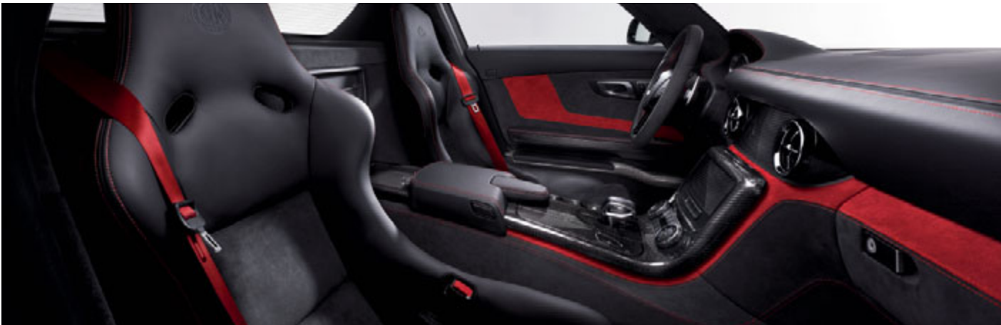
designo black leather/red Alcantara®

The optional Alcantara® appointments in red – for the door centre panels, lower section of the dashboard and centre console – lend the car an even sportier aura (Code 611).