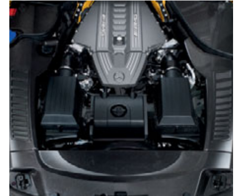
AMG carbon-fibre engine compartment cover (Code B14)