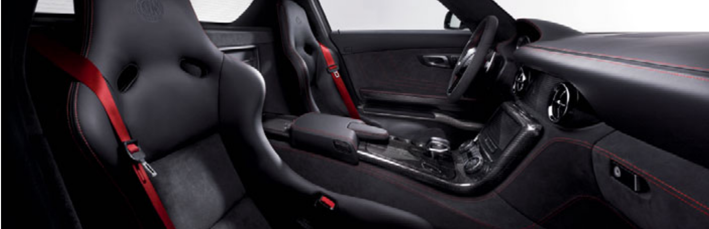
designo black leather/anthracite Alcantara®

The interior also embodies everything a thoroughbred super sports car should be: high-grade designo leather, lightweight carbon fibre and easy-grip Alcantara® create an authentic motorsport experience throughout (Code 601).