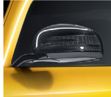
AMG carbon-fibre exterior mirrors (Code 773)