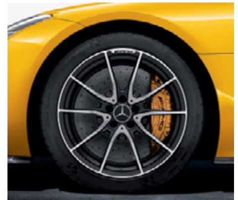
AMG 10-spoke forged wheels with 275/35 R 19 front and 325/30 R 20 rear tyres, painted matt black with a high-shine finish (standard, Code 657)