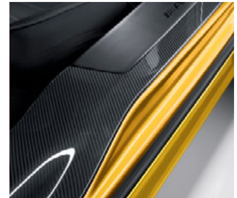
AMG Interior Carbon-Fibre package (door sill, Code 31P)