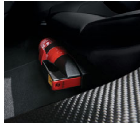
Fire extinguisher at front mounted on driver's seat (Code 682)