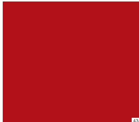
AMG Le Mans red