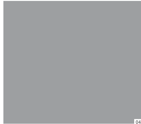
designo magno allanite grey