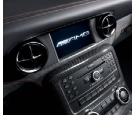
Infotainment system comprising COMAND APS, reversing camera and AMG Performance Media (Code P70)