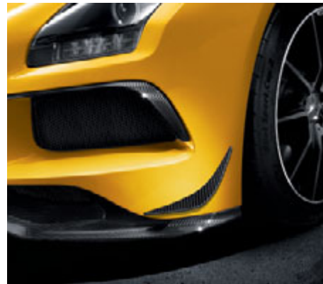
AMG Aerodynamics package (flics) (Code B26)