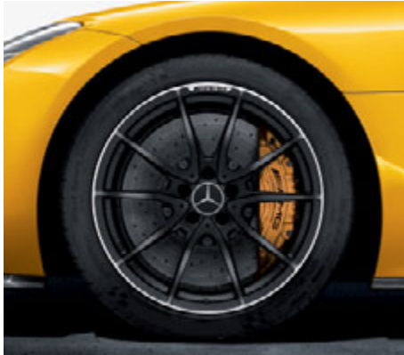
AMG 10-spoke forged wheels with 275/35 R 19 front and 325/30 R 20 rear tyres, painted matt black, rim flange with a high-sheen finish (Code 658)