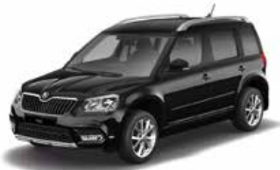
Black Magic pearl effect