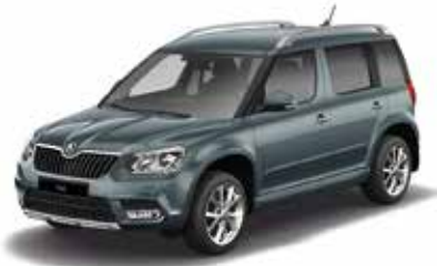
Quartz Grey metallic