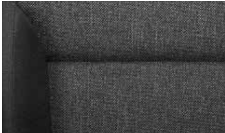
Yeti 81TSI interior Black fabric