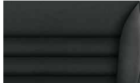
Optional interior - Yeti 4x4 Outdoor Leather appointed seat upholstery ^