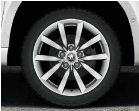
7.0J x 17" Scudo alloy wheels for 225/50 R17 tyres; Yeti 81TSI