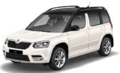
Moon White metallic with Black Magic roof

Please note that Metallic and Pearl Effect Paint are optional at a extra cost. The print process does not allow for exact reproduction of the exterior or the upholstery colours. Please contact your authorised ŠKODA dealer for further information on colours and upholstery combinations. Overseas models are shown for illustrative purposes only.