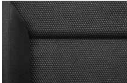
Yeti 4x4 Outdoor interior Black fabric