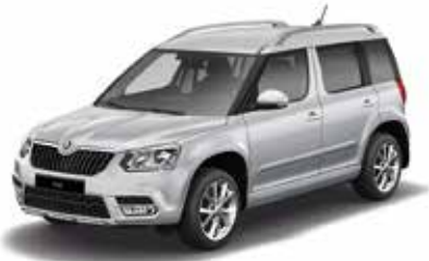
Brilliant Silver metallic