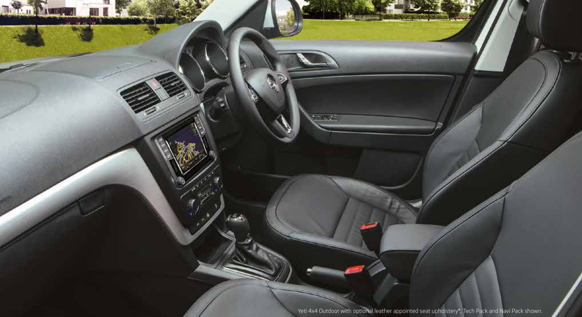
Yeti 4x4 Outdoor with optional leather appointed seat upholstery*, Tech Pack and Navi Pack shown.

The Yeti 4x4 Outdoor interior comes with black fabric upholstery and black dashboard with silver trim. In addition to standard features on Yeti 81T5I, the Yeti 4x4 Outdoor has front and rear parking sensors, climate control air-conditioning, light assist, rain sensor and front fog lights as standard.