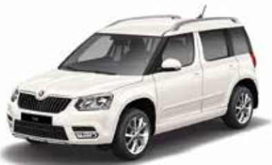
Moon White metallic