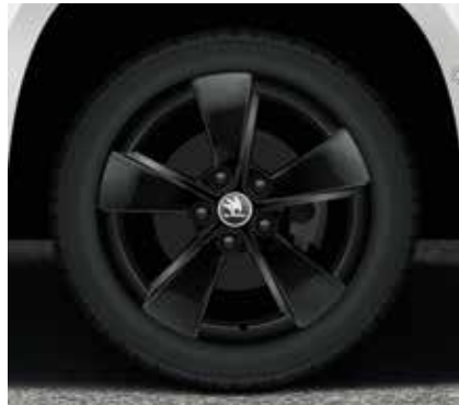
7.0J x 17" Erebus black alloy wheels for 225/50 R17 tyres; Yeti 4x4 Outdoor