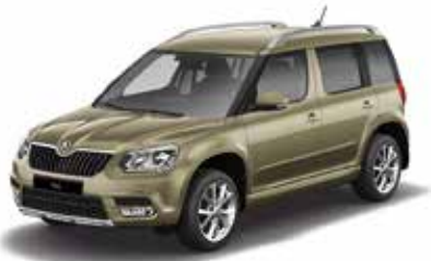
Jungle Green metallic