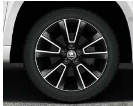
7.0J x 17" Matterhorn alloy wheels for 225/50 R17 tyres; Yeti 4x4 Outdoor with Off-road Pack