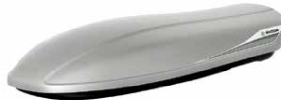
Lockable ski and snowboard box