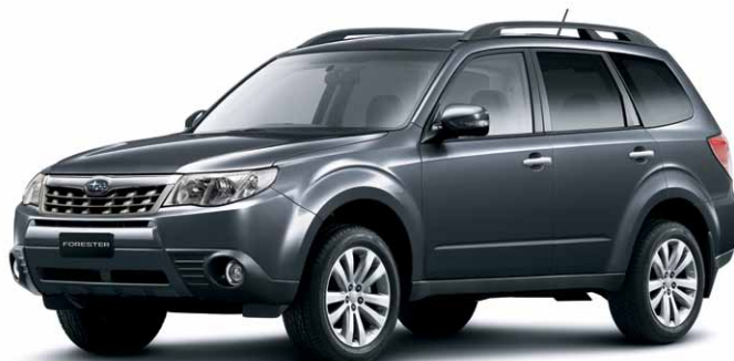
DARK GREY METALLIC