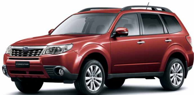
CAMELLIA RED PEARL