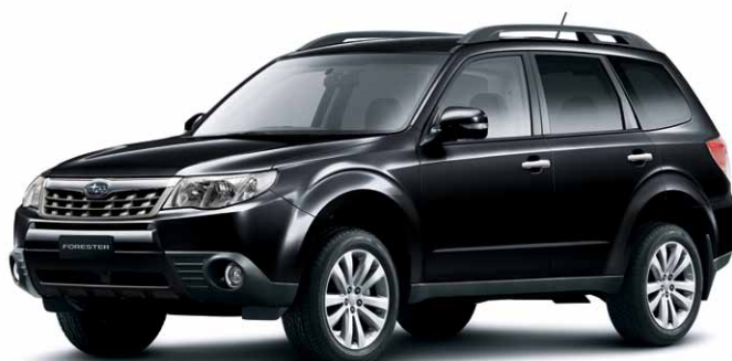
OBSIDIAN BLACK PEARL