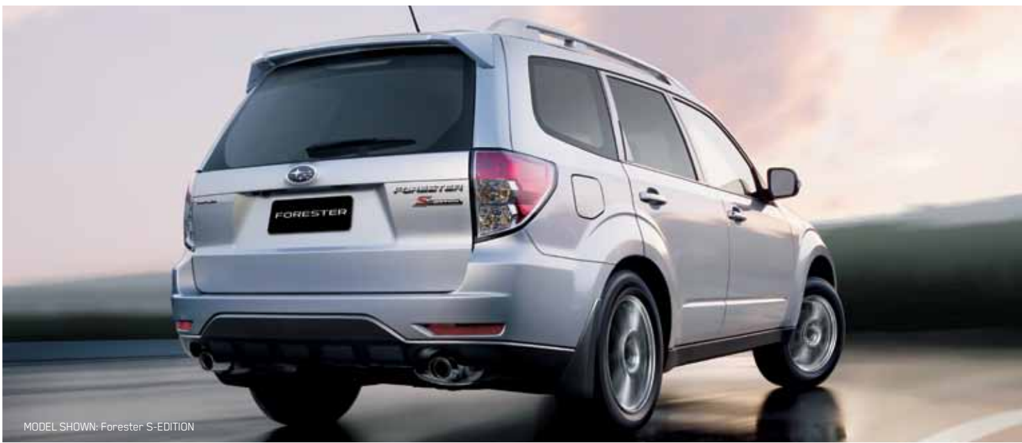
MODEL SHOWN: Forester S-EDITION