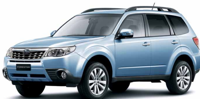
SKY BLUE METALLIC 1