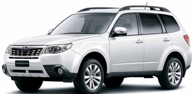
SATIN WHITE PEARL

One of the final choices – but one of the most important! The colour you choose for your Forester makes a bold statement about who you are. So we've made sure you've got lots of ways to express yourself – with a wide range of colours to make your Forester more... you.