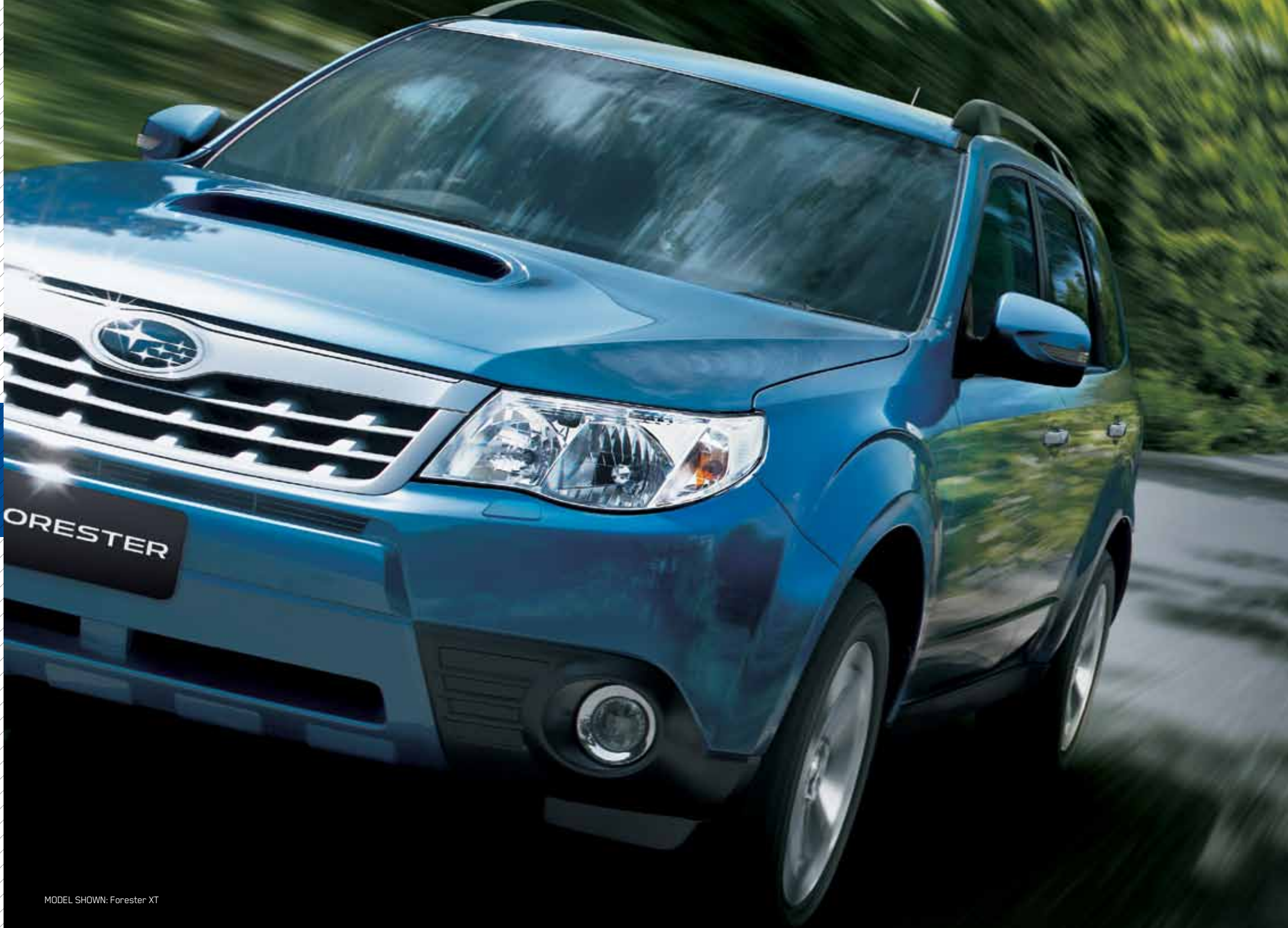
MODEL SHOWN: Forester XT