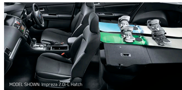
MODEL SHOWN: Impreza 2.0i-L Hatch