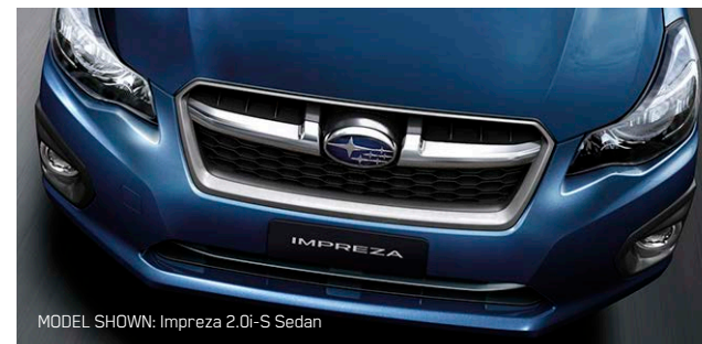
MODEL SHOWN: Impreza 2.0i-S Sedan