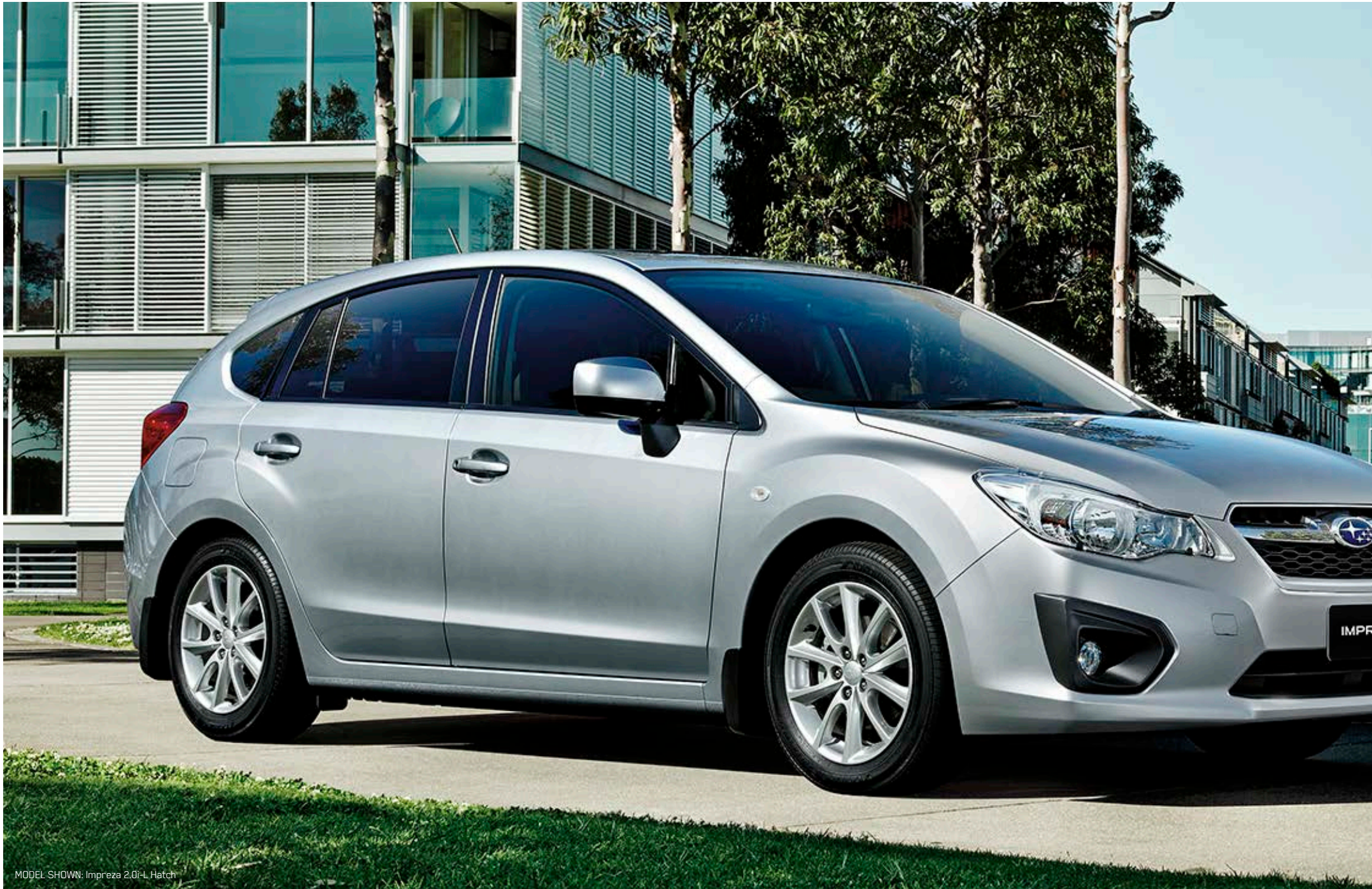
MODEL SHOWN: Impreza 2.0i-L Hatch