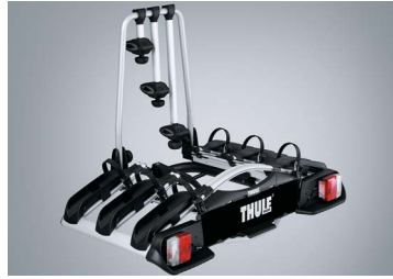
TOW BALL MOUNTED BIKE CARRIER (THREE BIKES)