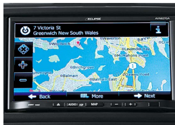
NAVIGATION UNIT 2