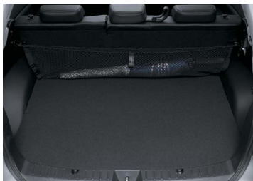
CARGO NET (REAR SEAT BACK)