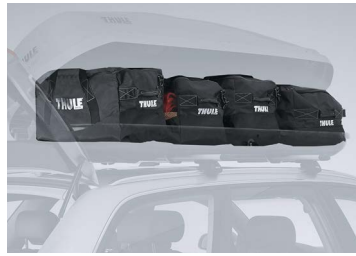
THULE GO PACK SET