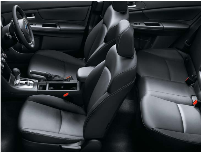
LEATHER: 1 BLACK OR IVORY: IMPREZA 2.0i-S