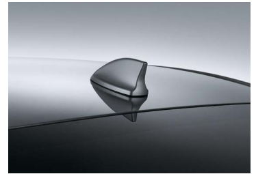
SHARK FIN ANTENNA