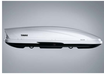
THULE MOTION 800 SILVER LUGGAGE POD 1