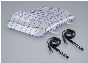
NET AND STRAPS FOR LUGGAGE RACK