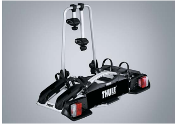
TOW BALL MOUNTED BIKE CARRIER (TWO BIKES)