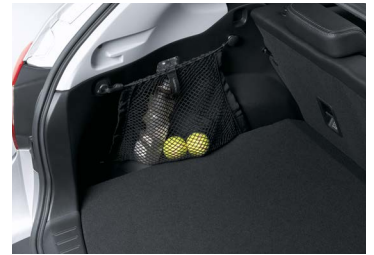
CARGO NET (SIDES)