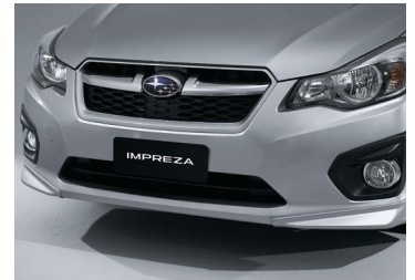
FRONT BUMPER SKIRT