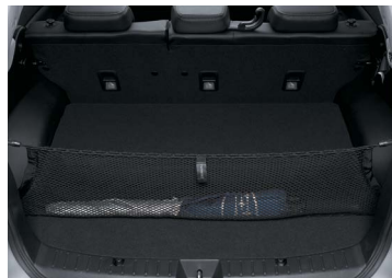
CARGO NET (REAR TAILGATE)