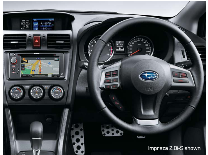
Impreza 2.0i-S shown