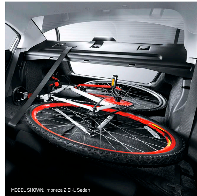
MODEL SHOWN: Impreza 2.0i-L Sedan