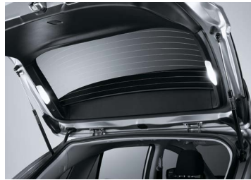
REAR HATCH LIGHT