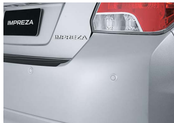
PARKING ASSIST (REAR)