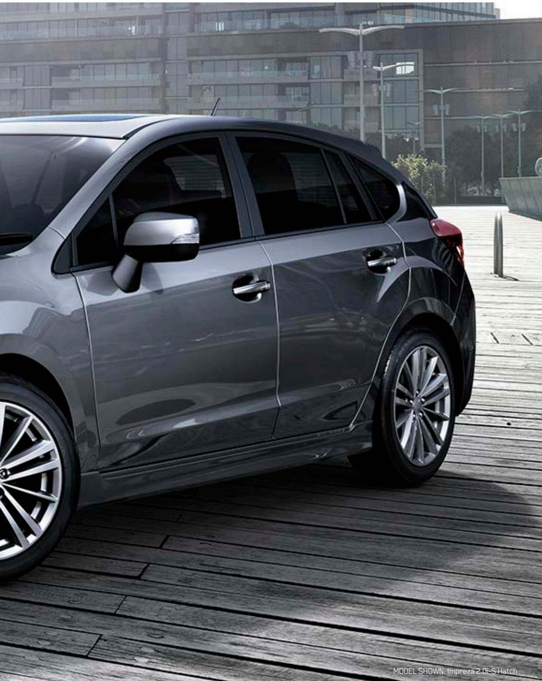
MODEL SHOWN: Impreza 2.0i-S Hatch