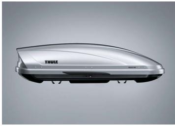
THULE MOTION 200 SILVER LUGGAGE POD 1