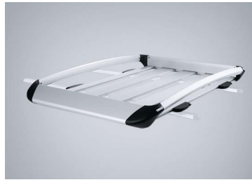
LUGGAGE RACK 1 (SMALL / LARGE)