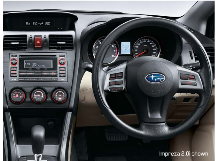
Impreza 2.0i shown