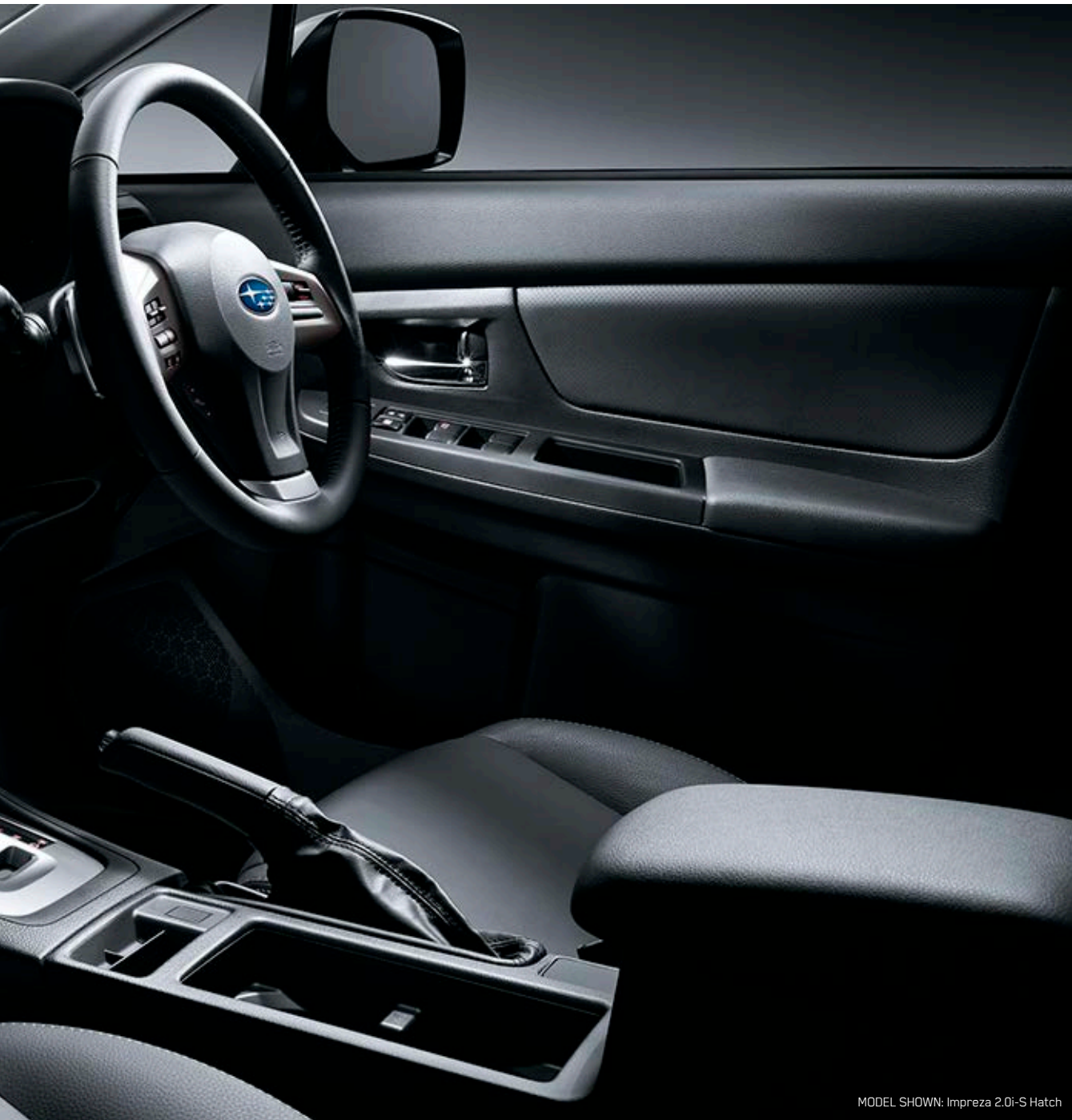
MODEL SHOWN: Impreza 2.0i-S Hatch