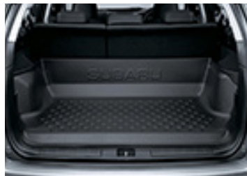
CARGO TRAY (DEEP DISH)