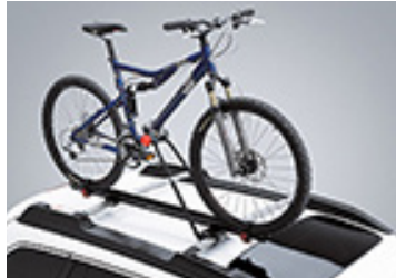
BICYCLE HOLDER (UPRIGHT)