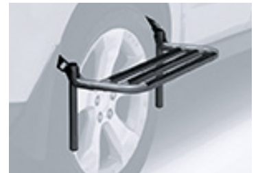
SIDE STEP UP