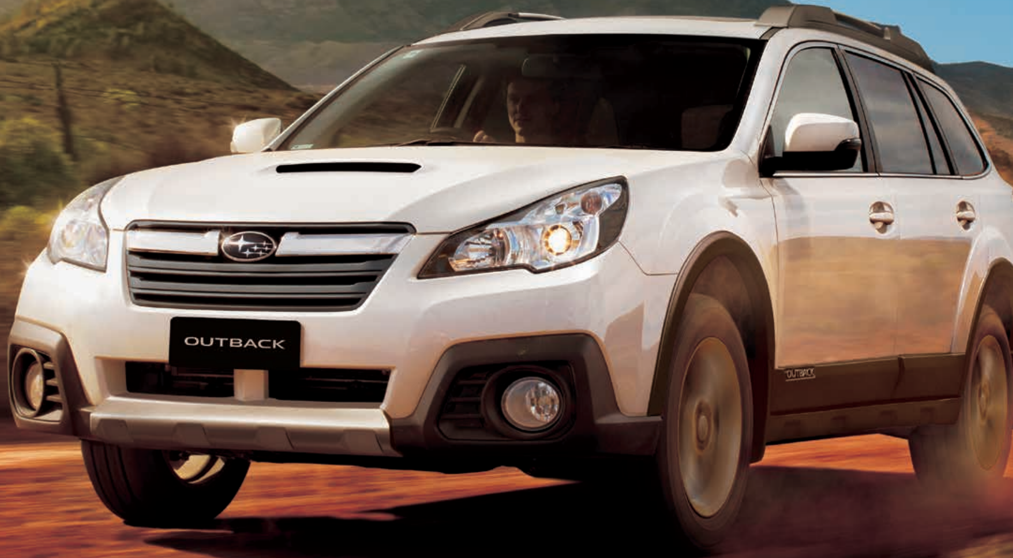
MODEL SHOWN: Outback 2.0D Premium Full Outback body kit fitted