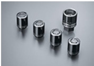
WHEEL LOCK NUTS