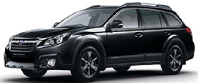
CRYSTAL BLACK SILICA