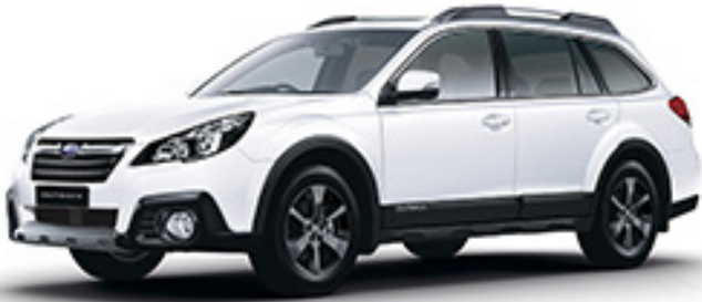
SATIN WHITE PEARL