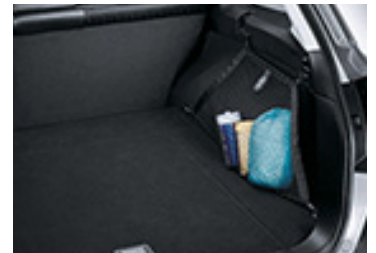
CARGO NET (SIDE x2)