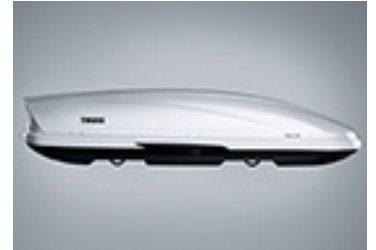
THULE MOTION 800 SILVER LUGGAGE POD