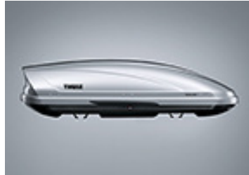
THULE MOTION 200 SILVER LUGGAGE POD