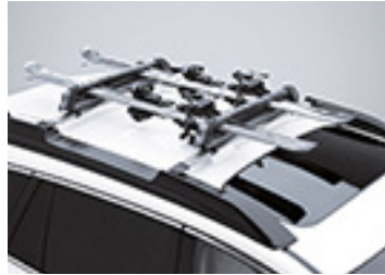
UNIVERSAL LOCKING ARMS