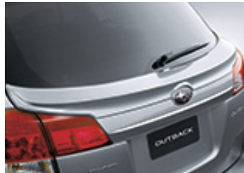
REAR WAIST SPOILER