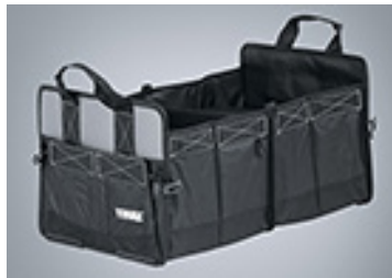
THULE GO BOX