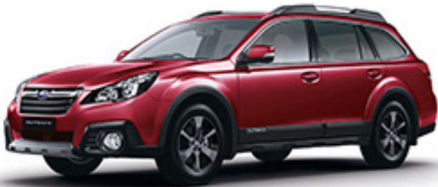
VENETIAN RED PEARL