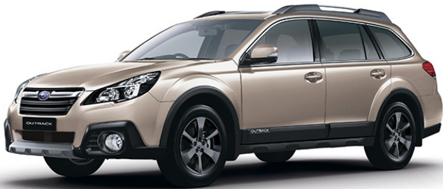
BURNISHED BRONZE METALLIC