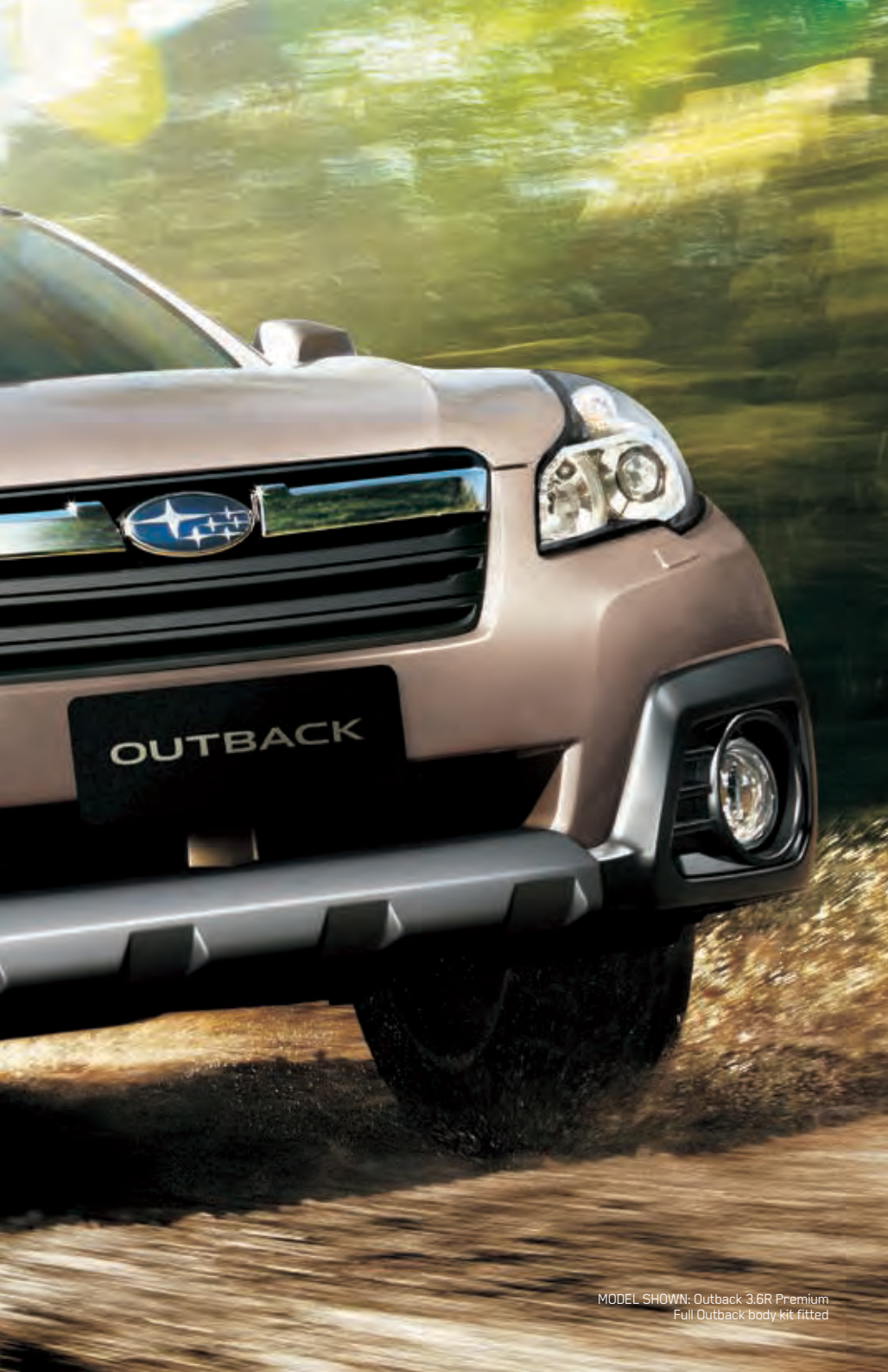
MODEL SHOWN: Outback 3.6R Premium Full Outback body kit fitted