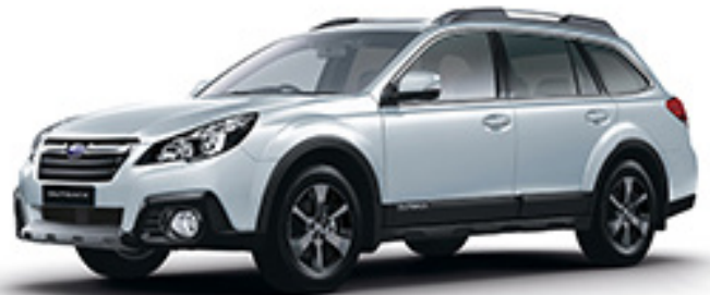
ICE SILVER METALLIC