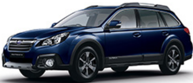
DEEP SEA BLUE PEARL