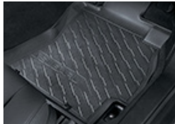
RUBBER FLOOR MAT