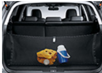
CARGO NET (REAR)