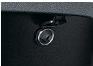
CARGO POWER SOCKET