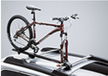
BICYCLE HOLDER (FORK MOUNTED)