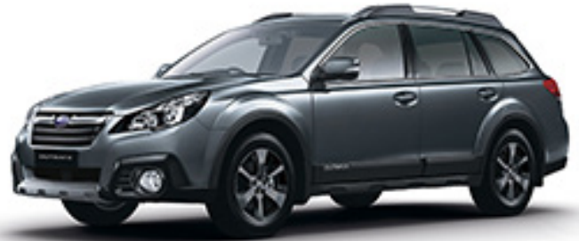
DARK GREY METALLIC