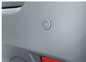
REAR PARK ASSIST