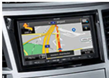
AVN NAVIGATION SYSTEM