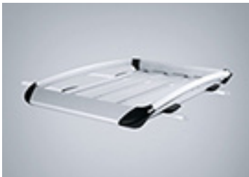
LUGGAGE RACK (SMALL)