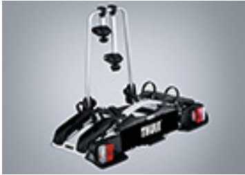
TOWBALL MOUNTED BIKE CARRIER (TWO BIKES)