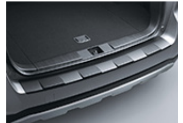
REAR STEP PANEL (RESIN)