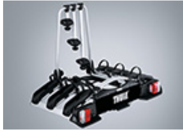
TOWBALL MOUNTED BIKE CARRIER (THREE BIKES)