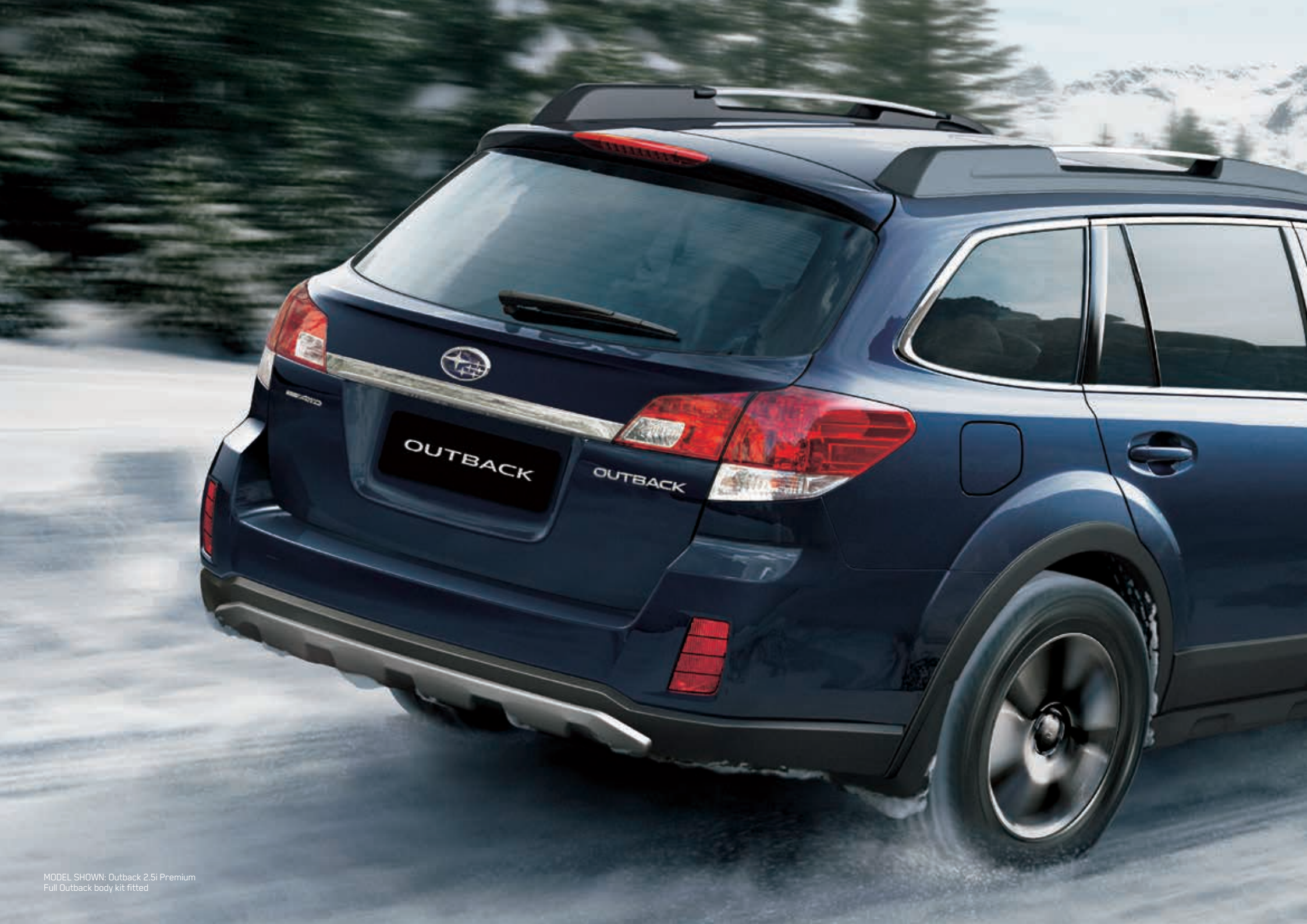
MODEL SHOWN: Outback 2.5i Premium Full Outback body kit fitted