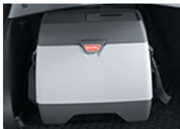
ADVENTURE PORTABLE FRIDGE (14 LITRE, 12V ONLY)