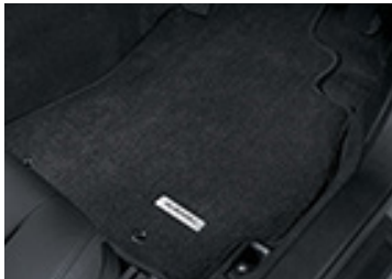
CARPET FLOOR MAT