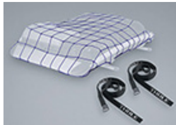
NET AND STRAPS FOR LUGGAGE RACK