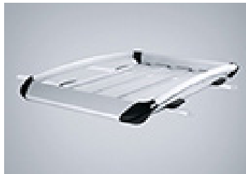
LUGGAGE RACK (LARGE)