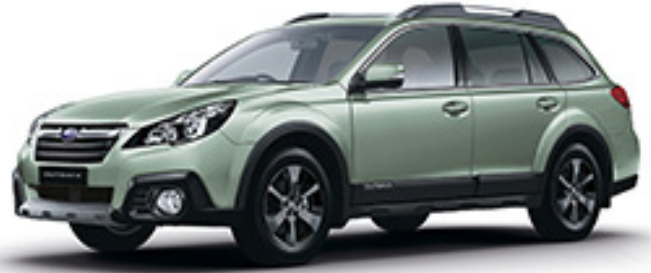
JASMINE GREEN METALLIC