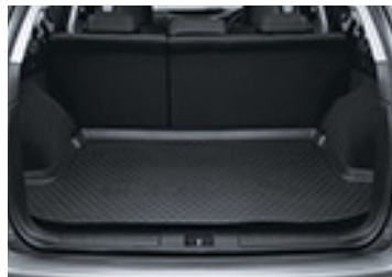
CARGO TRAY (LOW DISH)