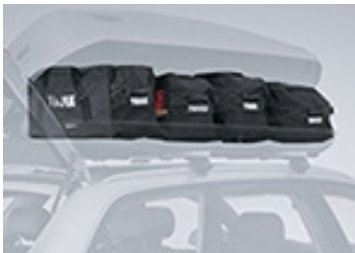
THULE GO PACK SET