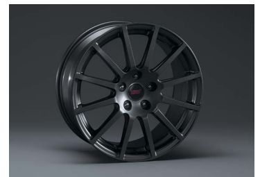
ENKEI 18 INCH ALLOY WHEEL - CHARCOAL