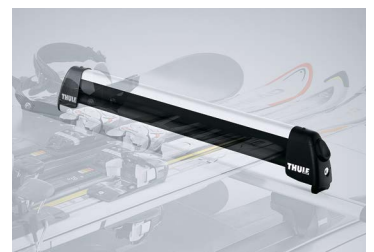
UNIVERSAL LOCKING ARMS 2