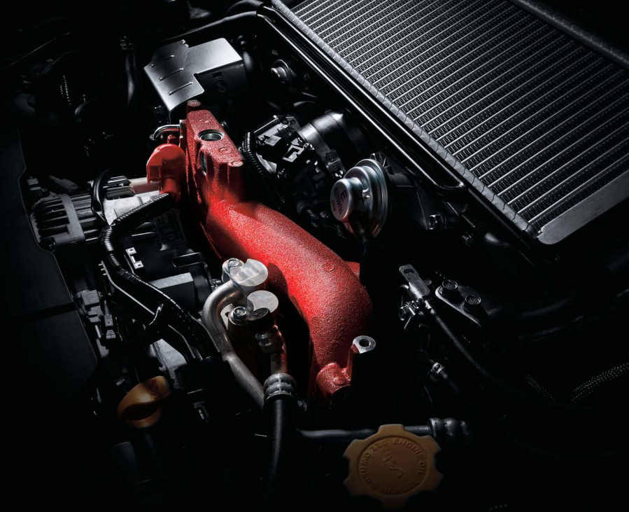
SUBARU WRX STI 2.5-LITRE, FOUR -CYLINDER DOHC TURBOCHARGED BOXER PETROL ENGINE - MANUAL TRANSMISSION 1

The Subaru WRX STI engine has also been finely tuned to deliver optimum power, torque, exhaust emissions, fuel economy and idling stability via Subaru's Dual Active Valve Control System (DAVCS) which varies the inlet and exhaust camshaft timing. This helps the Subaru WRX STI produce an astonishing 221kW of power at 6,000rpm and maximum torque of 407Nm at 4,000rpm, providing thrilling sports performance and drivability. The Subaru WRX STI is a pure performance pedigree that demands and delivers the best with a precise six-speed manual transmission.