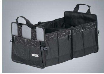
THULE GO BOX