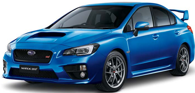
WR BLUE PEARL