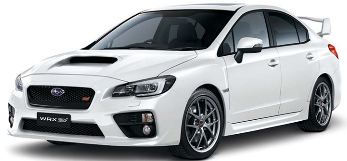
CRYSTAL WHITE PEARL