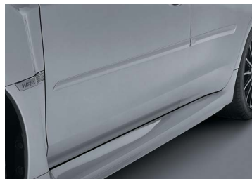
BODY SIDE MOLDING