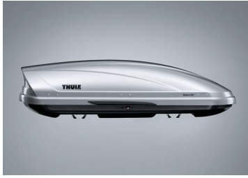
THULE MOTION 200 SILVER LUGGAGE POD 2