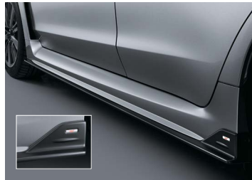
SIDE UNDER SPOILER