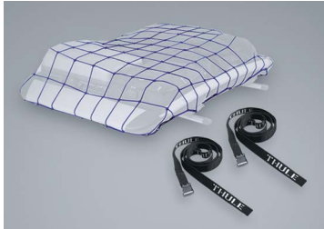
NET AND STRAPS FOR LUGGAGE RACK