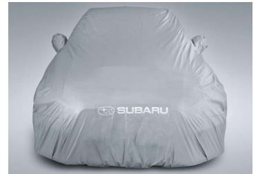
CAR COVER 1