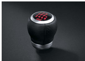
SPORTS LEATHER GEAR KNOB (6MT)