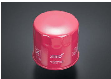
COMPETITION OIL FILTER