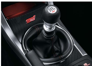
STI LEATHER GEAR KNOB (6MT)