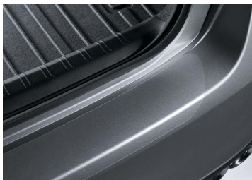
REAR BUMPER APPLIQUE