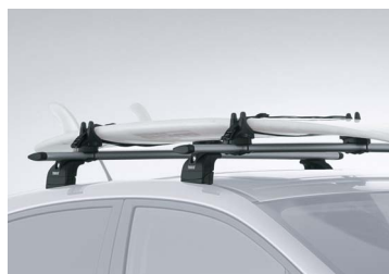
SURFBOARD CARRIER 2