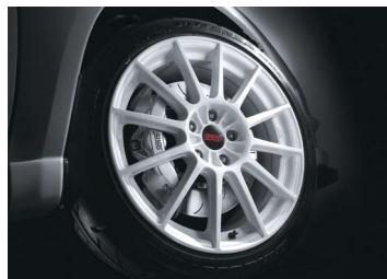
ENKEI 18 INCH ALLOY WHEEL - WHITE