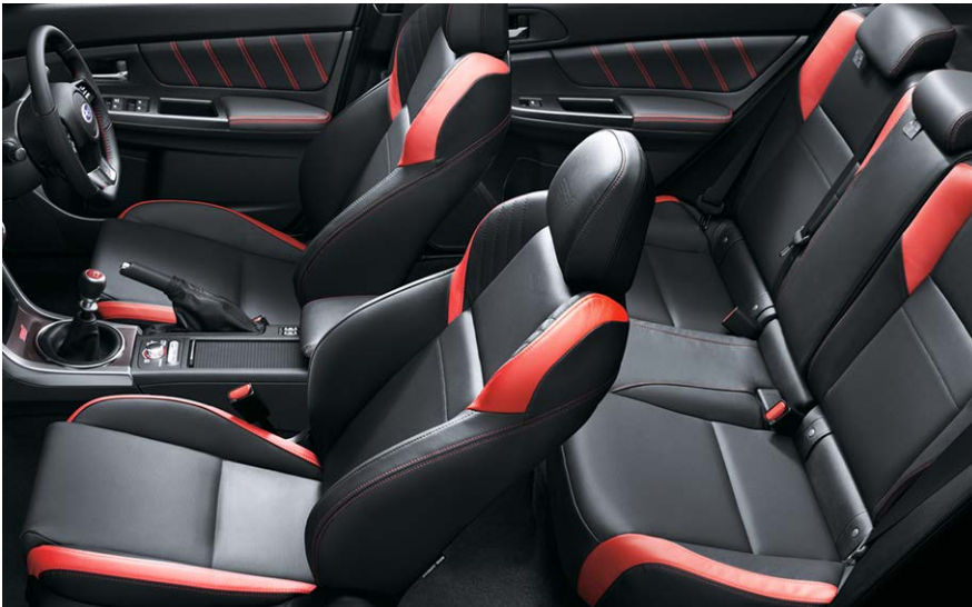
BLACK LEATHER 1 : SUBARU WRX STI PREMIUM