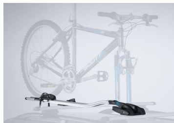
BICYCLE HOLDER 2 (FORK MOUNTED)