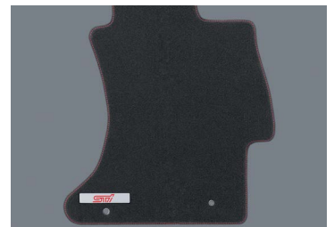
CARPET FLOOR MATS