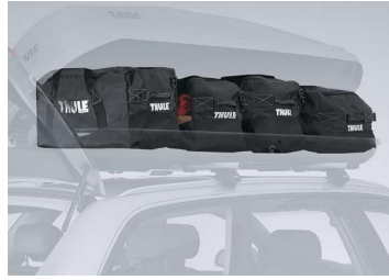
THULE GO PACK SET