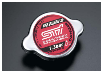
HIGH PRESSURE RADIATOR CAP