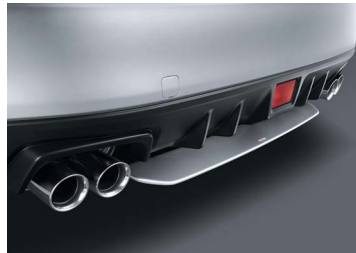
REAR UNDER SPOILER