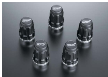
WHEEL LOCK NUT SET OF 20 (BLACK)