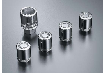
WHEEL LOCK NUTS