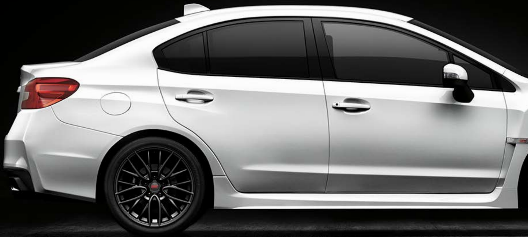
MODEL SHOWN: SUBARU WRX STI WITHOUT SPOILER