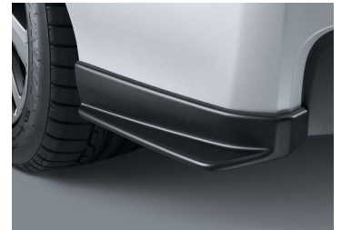
REAR SIDE UNDER SPOILER