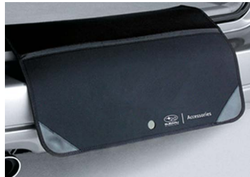
BOOT LIP AND BUMPER PROTECTOR