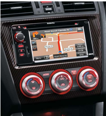
MULTI-INFORMATION IN-DASH SATELLITE NAVIGATION SYSTEM: SUBARU WRX STI AND WRX STI PREMIUM