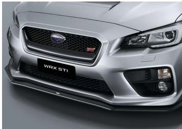
FRONT LIP SPOILER