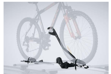
BICYCLE HOLDER 2 (UPRIGHT)