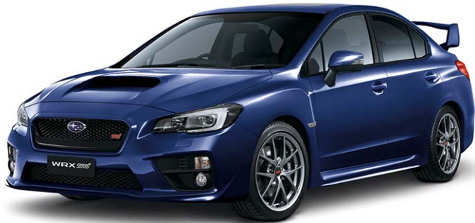
GALAXY BLUE SILICA