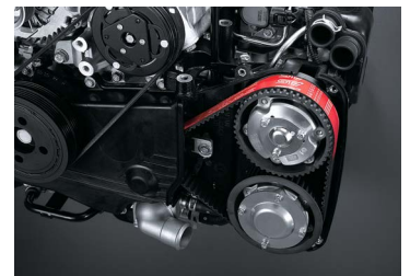
COMPETITION TIMING BELT