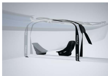
WATERCRAFT HOLDER 2