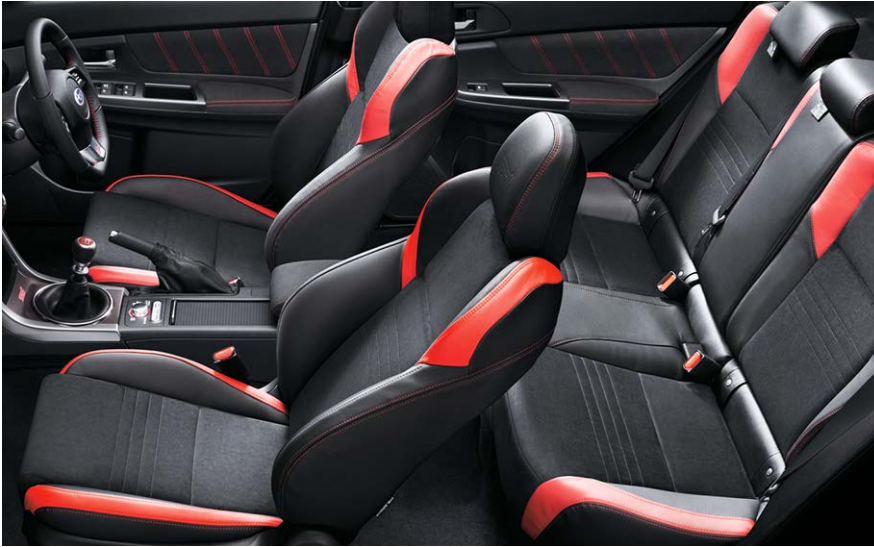
BLACK: ALCANTARA® WITH LEATHER 1 ACCENTS SUBARU WRX STI