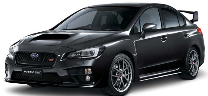
CRYSTAL BLACK SILICA