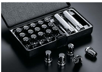
SECURITY WHEEL NUT SET