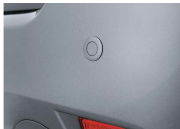
REAR & FRONT CORNER MULTI-FUNCTION PARKING SENSORS