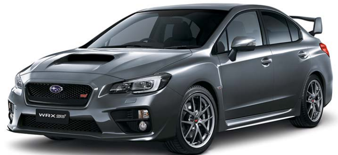
DARK GREY METALLIC