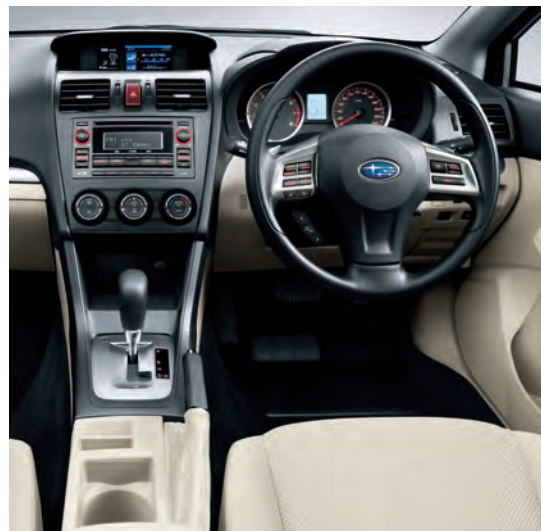
SUBARU XV 2.0i SHOWN