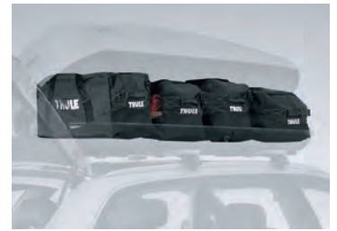
THULE GO PACK SET