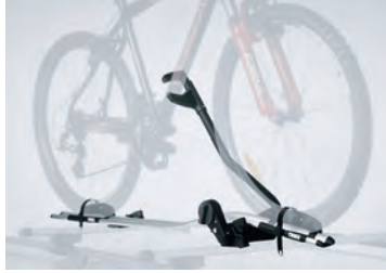
BICYCLE HOLDER (UPRIGHT)