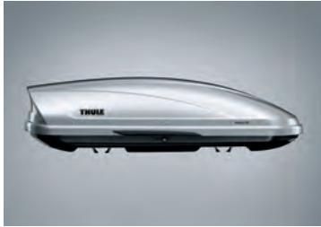
THULE MOTION 200 SILVER LUGGAGE POD