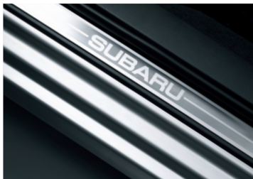
SIDE SILL PLATE