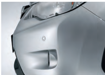
PARKING ASSIST (FRONT)