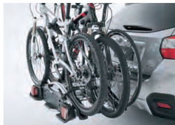
TOW BALL MOUNTED BIKE CARRIER (THREE BIKES)