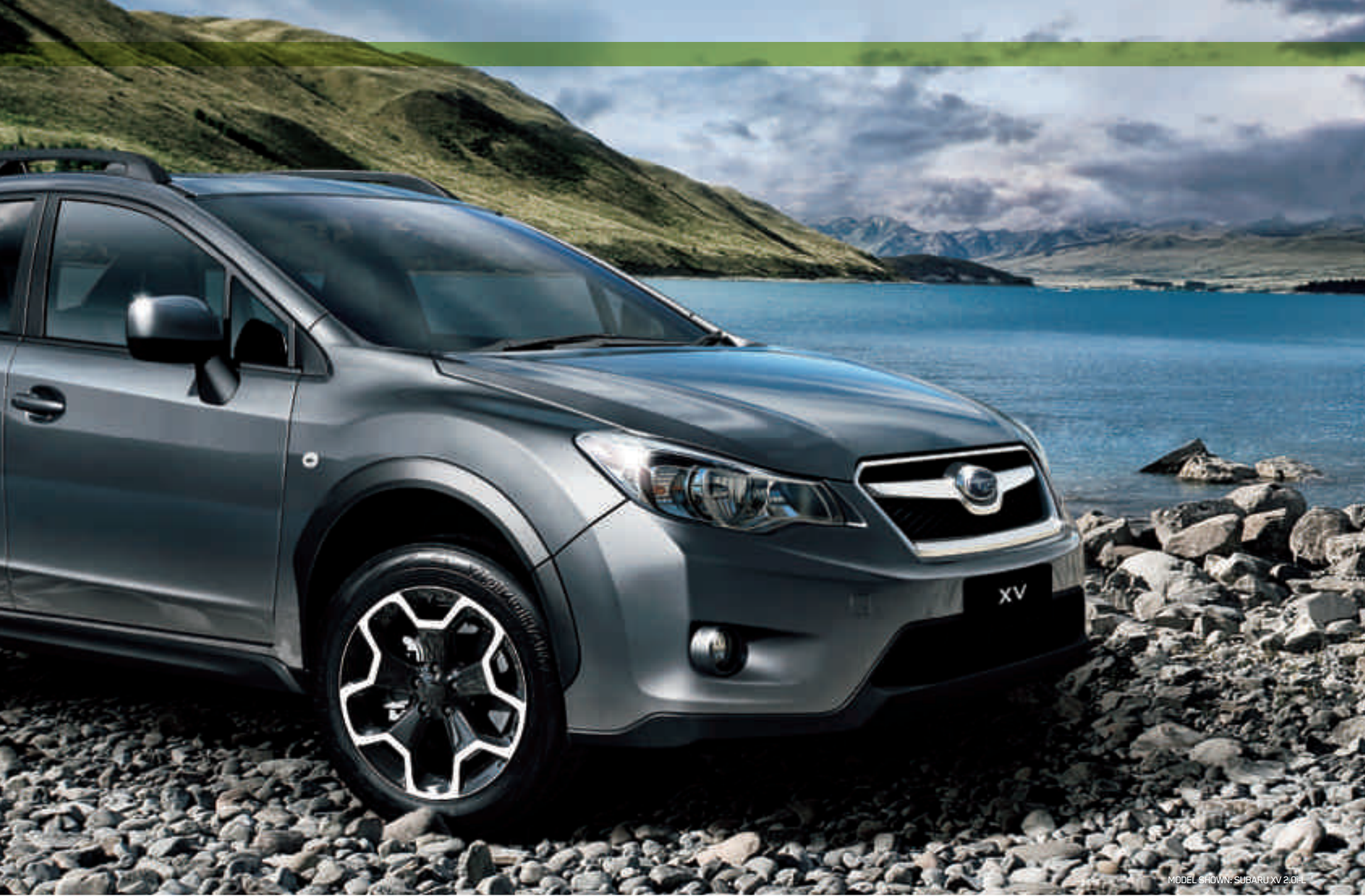
MODEL SHOWN: SUBARU XV 2.0iL