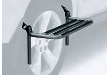
SIDE STEP UP