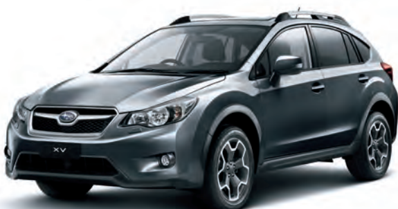
DARK GREY METALLIC