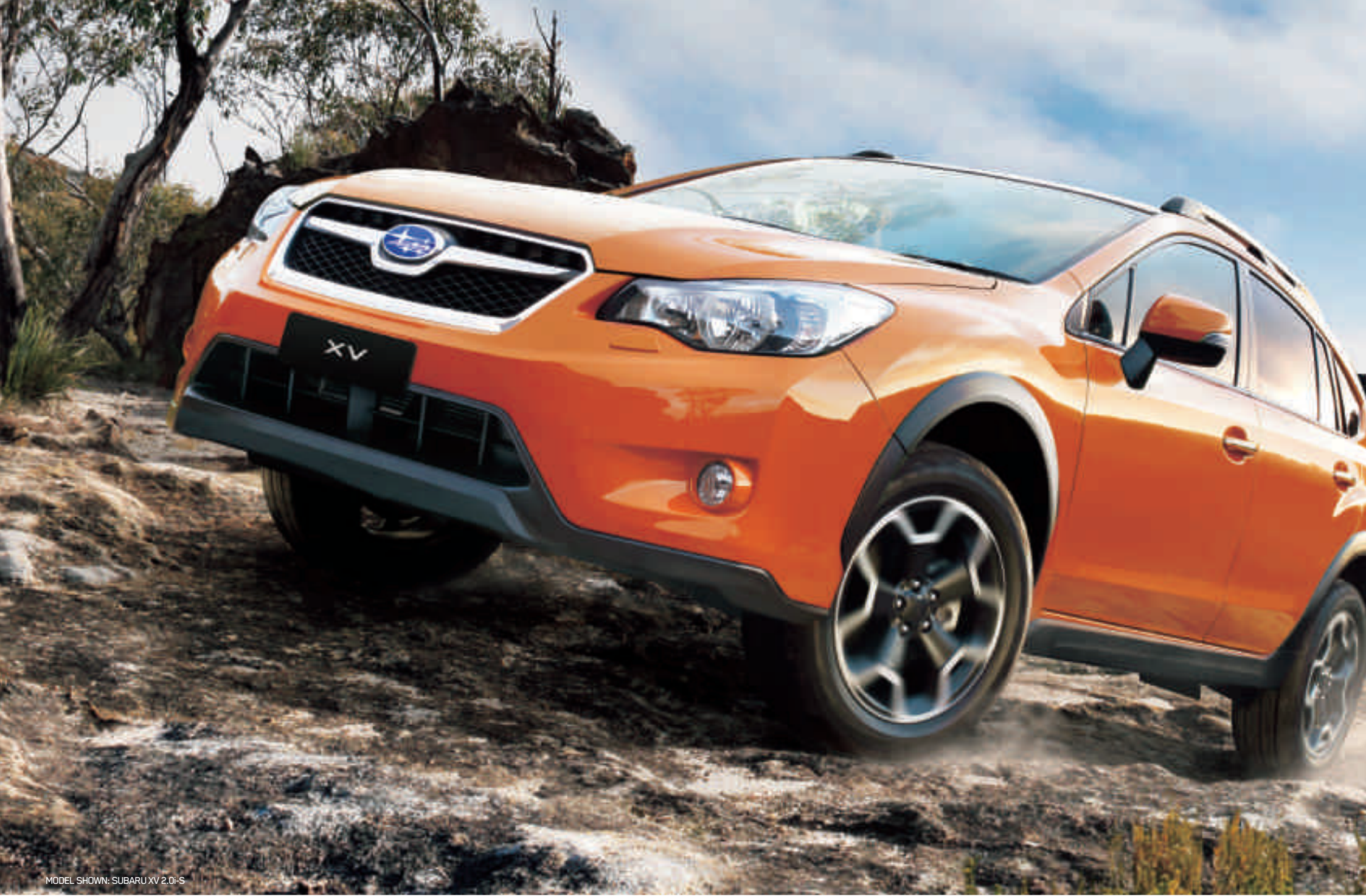
MODEL SHOWN: SUBARU XV 2.0i-S