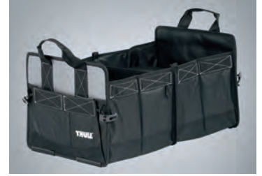
THULE GO BOX