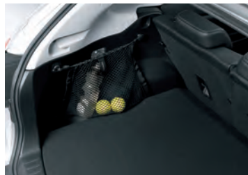
CARGO NET (SIDES)