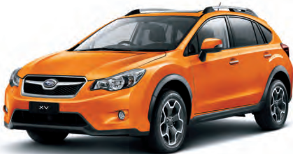
TANGERINE ORANGE PEARL