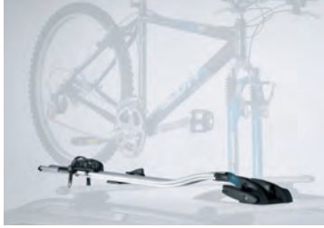
BICYCLE HOLDER (FORK MOUNTED)