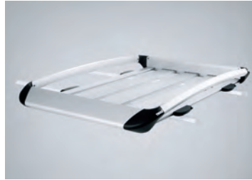
LUGGAGE RACK (SMALL AND LARGE)