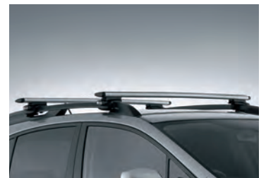
ROOF CROSS BARS