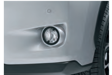
FOG LAMP PROTECTOR