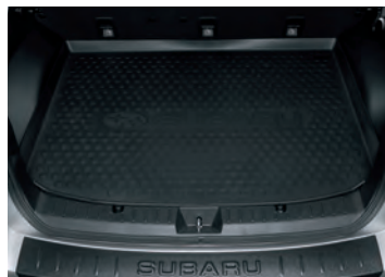
CARGO TRAY (LOW DISH)