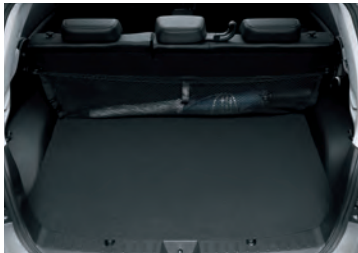
CARGO NET (REAR SEAT BACK)