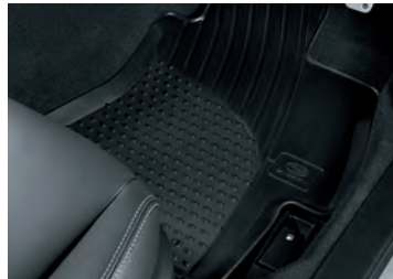
RUBBER MAT SET