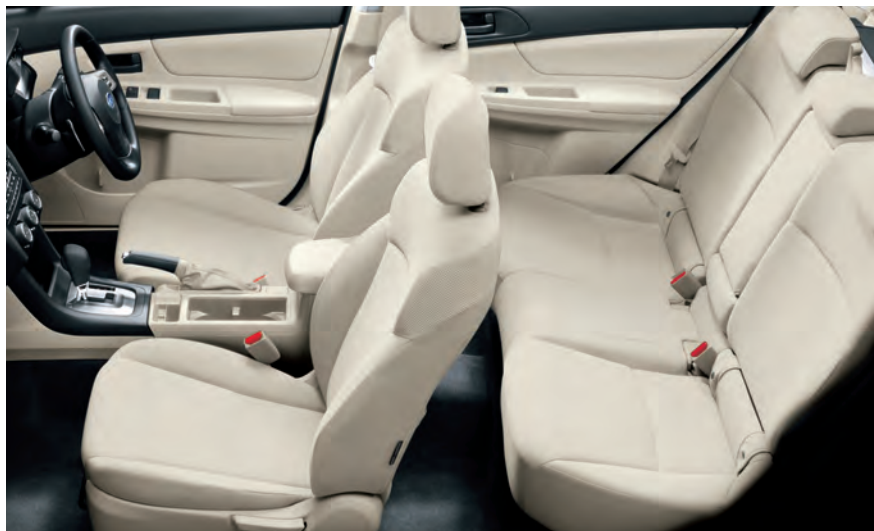
CLOTH: CHOICE OF BLACK OR IVORY: SUBARU XV 2.0i AND SUBARU XV 2.0i-L