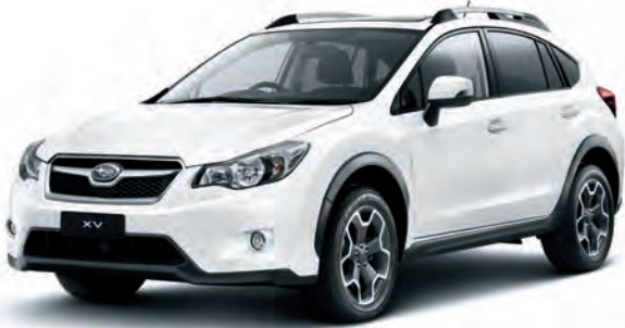
SATIN WHITE PEARL

Always check with your authorised Subaru Retailer regarding colour availability of your selected model before purchase.