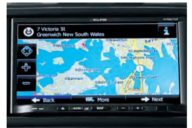
AVN NAVIGATION SYSTEM 2