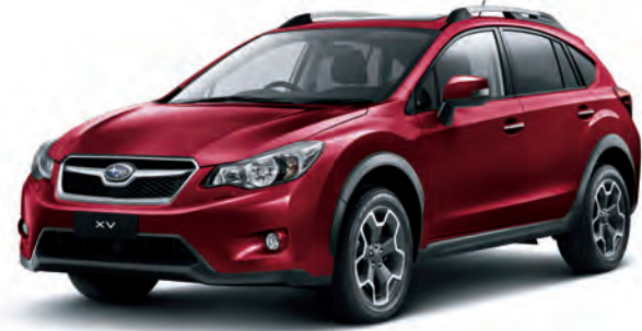
VENETIAN RED PEARL