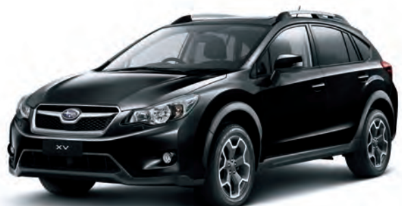
CRYSTAL BLACK SILICA