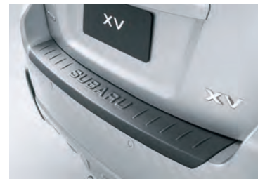
CARGO STEP PANEL (RESIN)