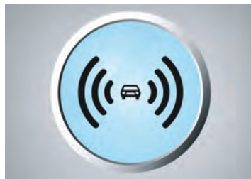
SECURITY ALARM SYSTEM