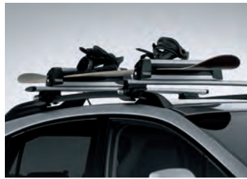
UNIVERSAL LOCKING ARMS