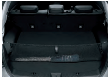
CARGO NET (REAR TAILGATE)

SUBARU.COM.AU FOR FULL DETAILS ON THE TAILOR-MADE ACCESSORIES AVAILABLE FOR YOUR SUBARU MODEL.