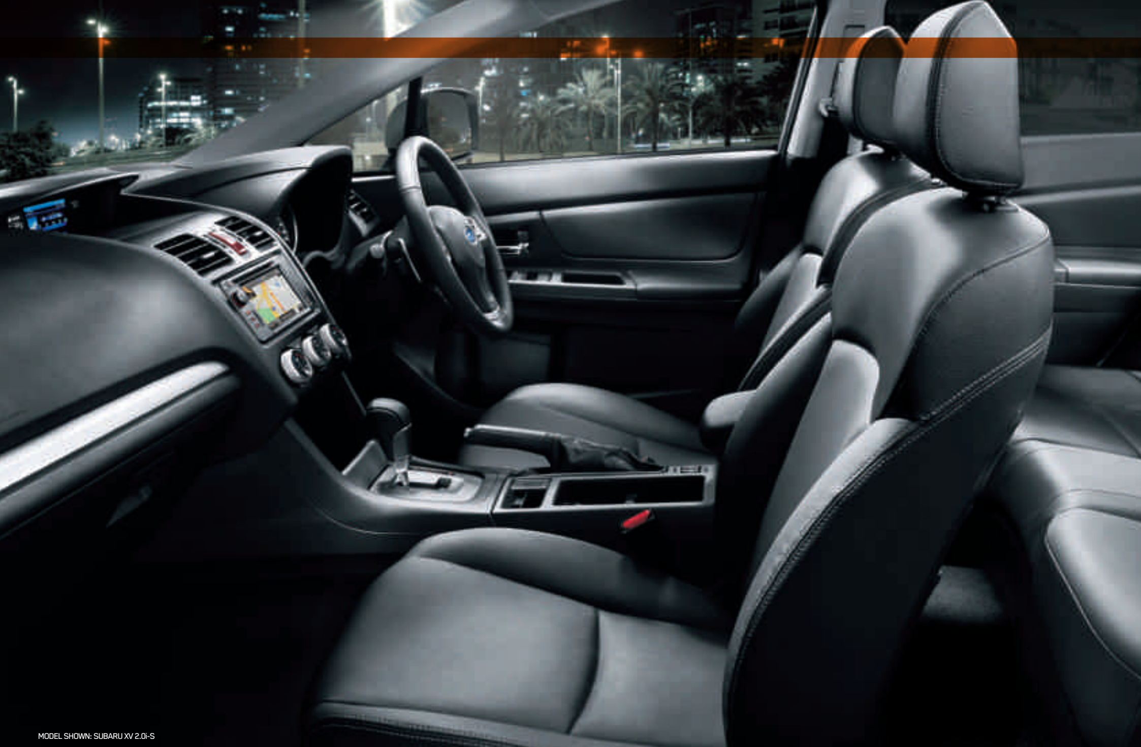
MODEL SHOWN: SUBARU XV 2.0i-S