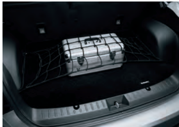
CARGO NET (FLOOR)