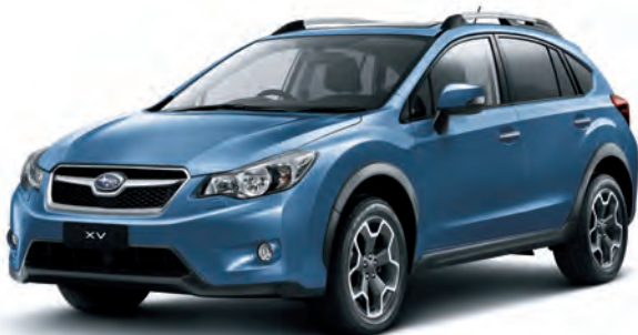
QUARTZ BLUE PEARL