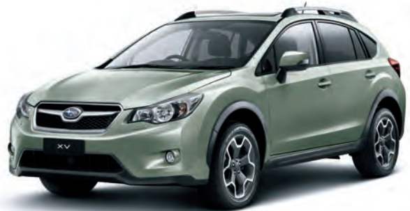
JASMINE GREEN METALLIC