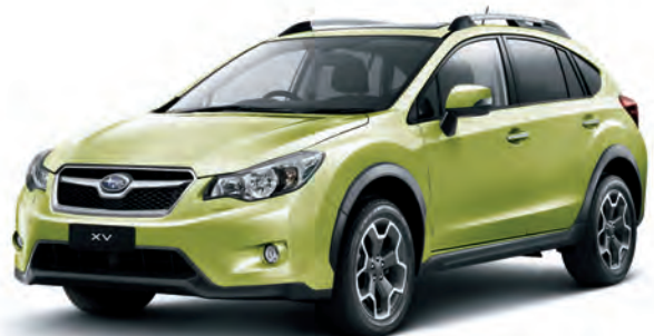
PLASMA GREEN PEARL