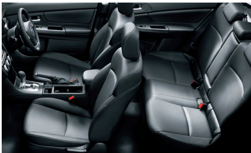
LEATHER: CHOICE OF BLACK OR IVORY: SUBARU XV 2.0i-S ONLY