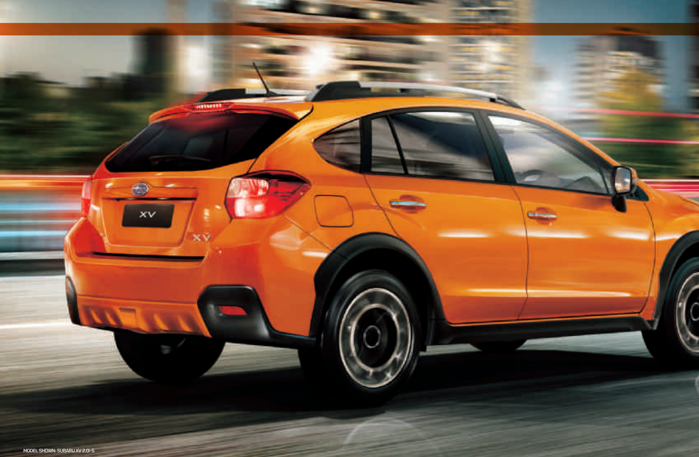
MODEL SHOWN: SUBARU XV 2.0i-S