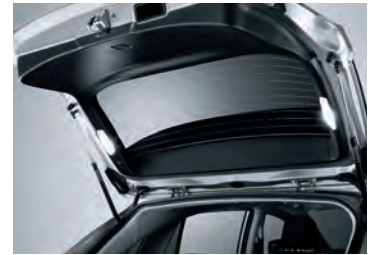
REAR HATCH LIGHTS