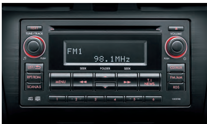
SINGLE IN-DASH CD PLAYER: SUBARU XV 2.0i