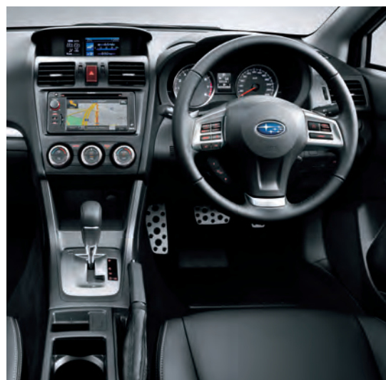
SUBARU XV 2.0i-S SHOWN