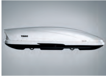
THULE MOTION 800 SILVER LUGGAGE POD