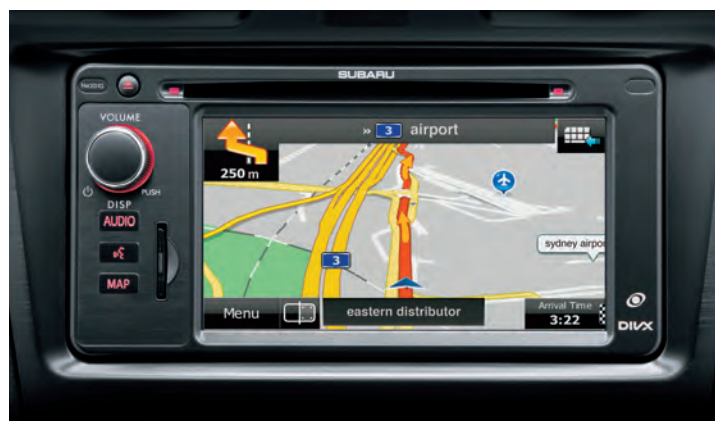
MULTI-INFORMATION IN-DASH SATELLITE NAVIGATION SYSTEM WITH 6.1-INCH TOUCH SCREEN, MP3/WMA/IPOD/DIVX COMPATIBLE, SINGLE CD PLAYER AND SIX SPEAKERS: SUBARU XV 2.0i-L AND SUBARU XV 2.0i-S