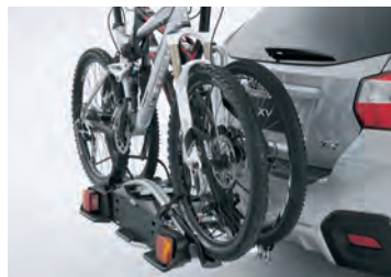
TOW BALL MOUNTED BIKE CARRIER (TWO BIKES)