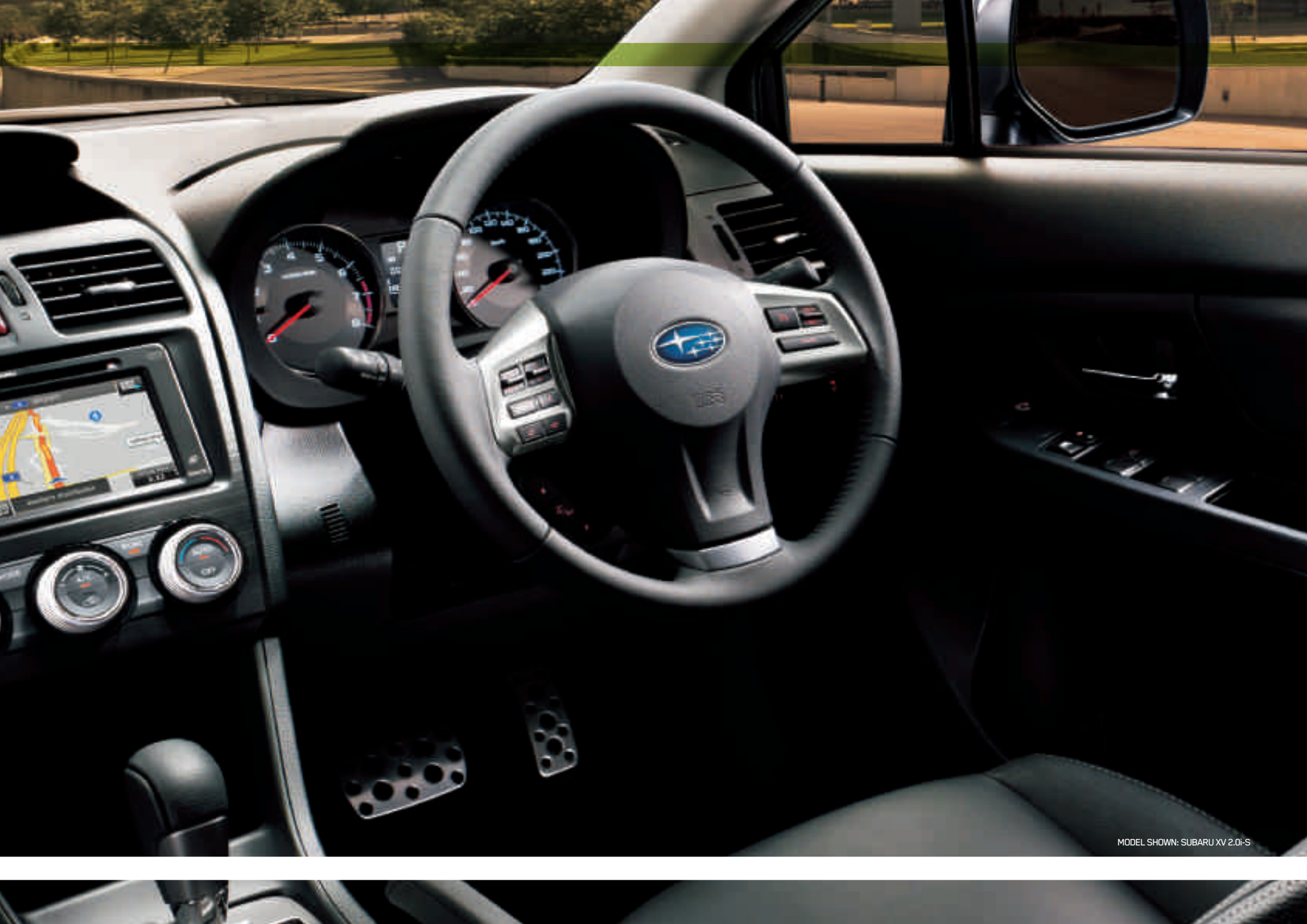
MODEL SHOWN: SUBARU XV 2.0i-S