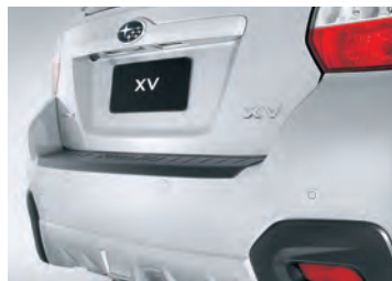
PARKING ASSIST (REAR)