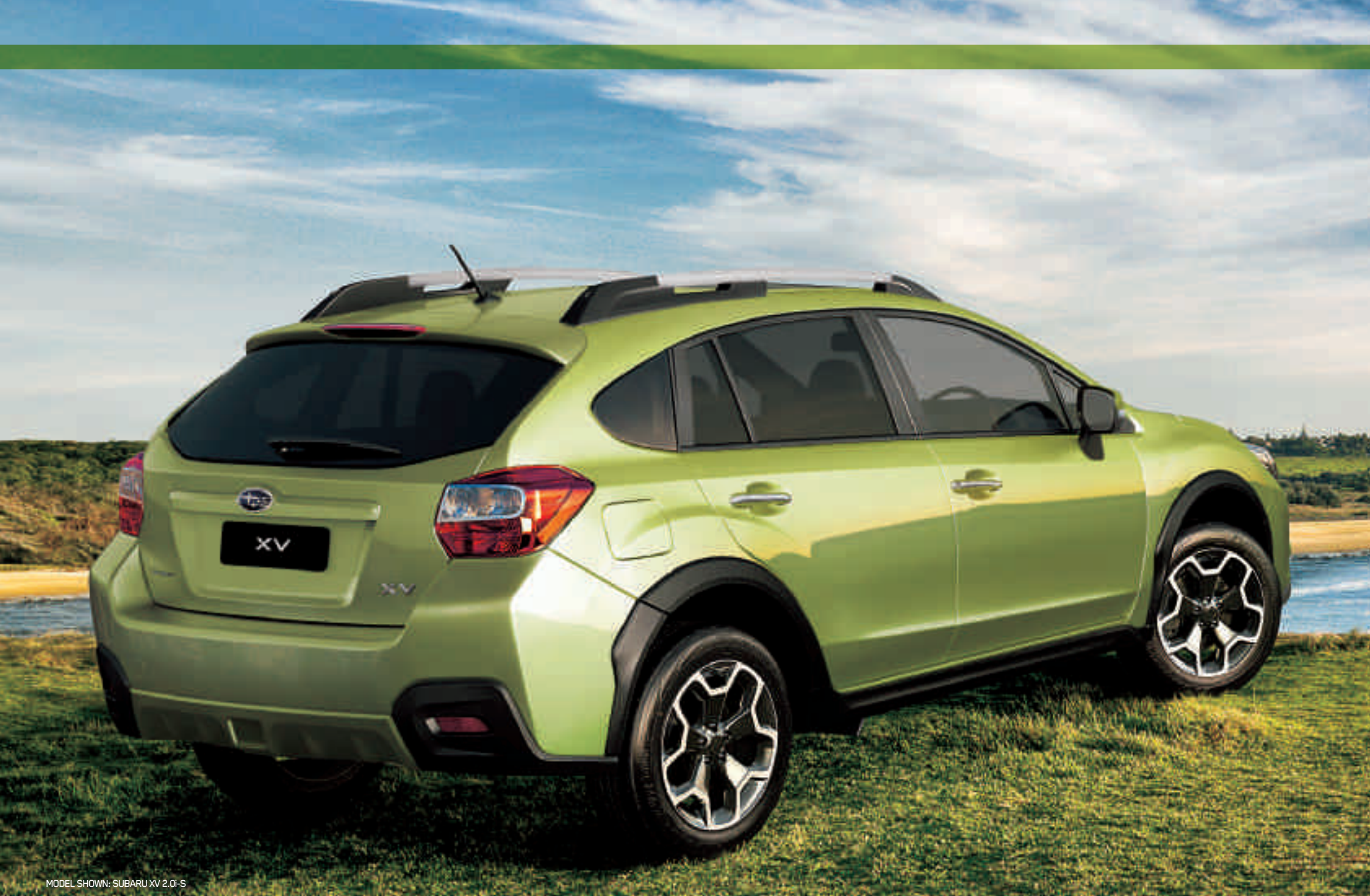
MODEL SHOWN: SUBARU XV 2.0i-S